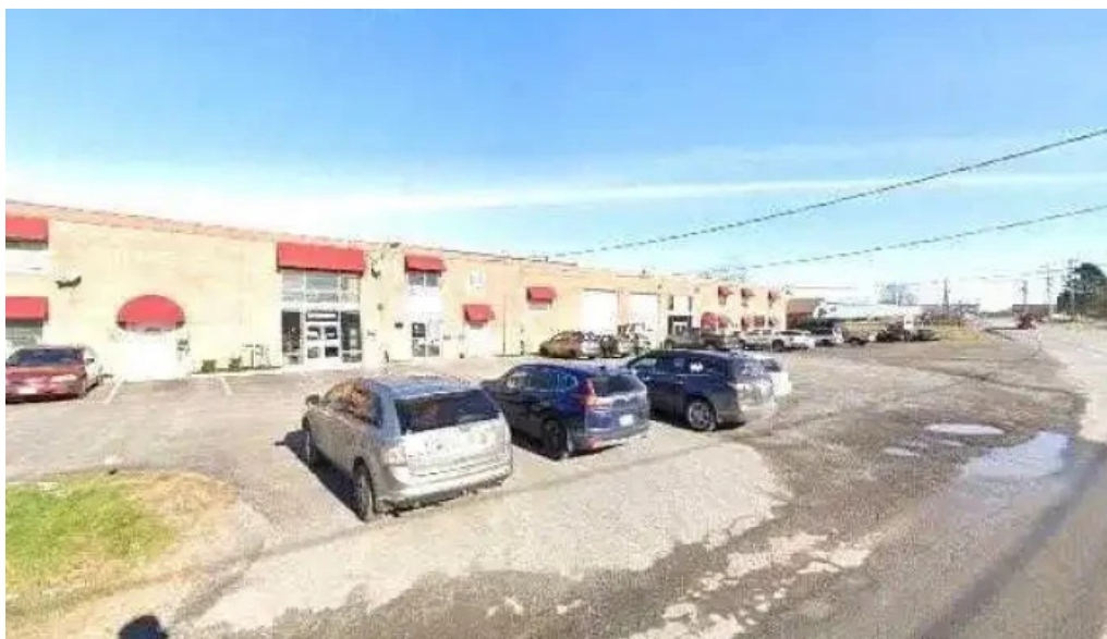
Kingston west psychological services all