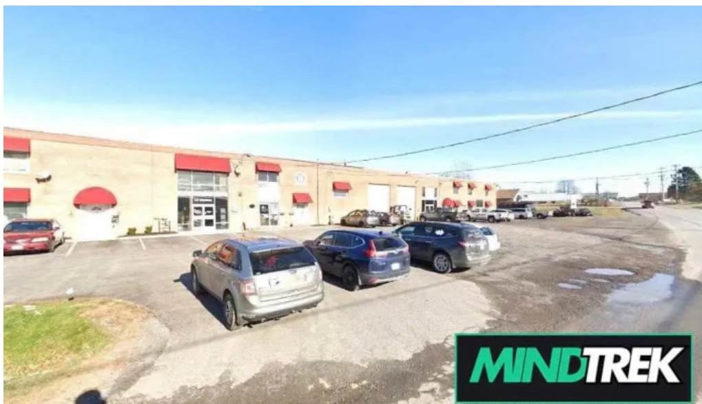
Kingston west psychological services kingston