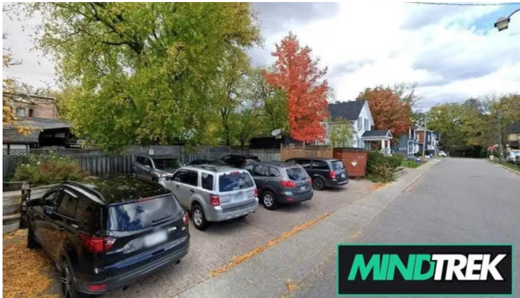
Centre for neuropsychology and emotional wellness markham