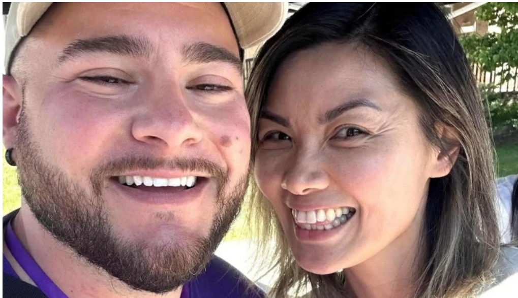
Centre for neuropsychology and emotional wellness psychologist