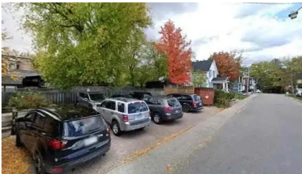
Centre for neuropsychology and emotional wellness all