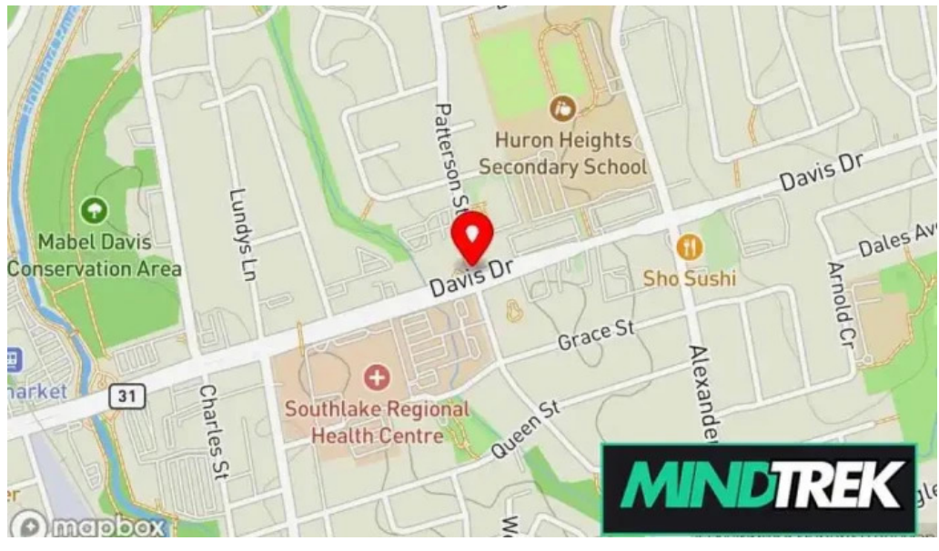
Ford cindy dr map