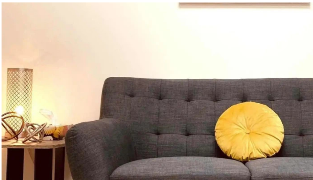
Mayerling hurtado cpsych clinical psychologist all