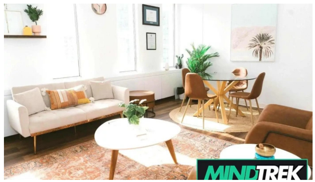
Uprise psychology wellness ottawa