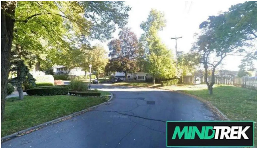
West ottawa psychology ottawa