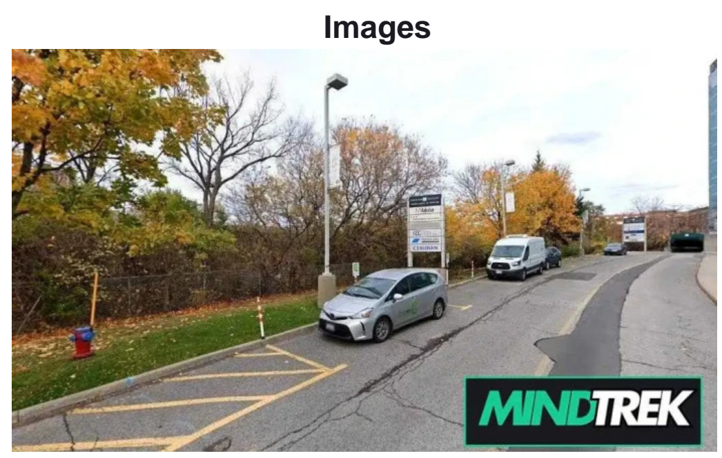
Zephyr psychological services ottawa

If you wish to update any information that you feel is not precise regarding this web, we ask send a message so that we will handle it promptly. Thanks beforehand we appreciate it.