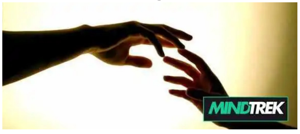
York region psychological services thornhill