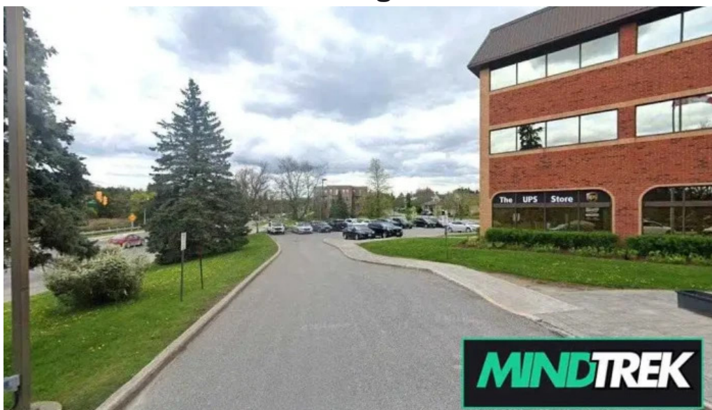
Your psychology centre uxbridge