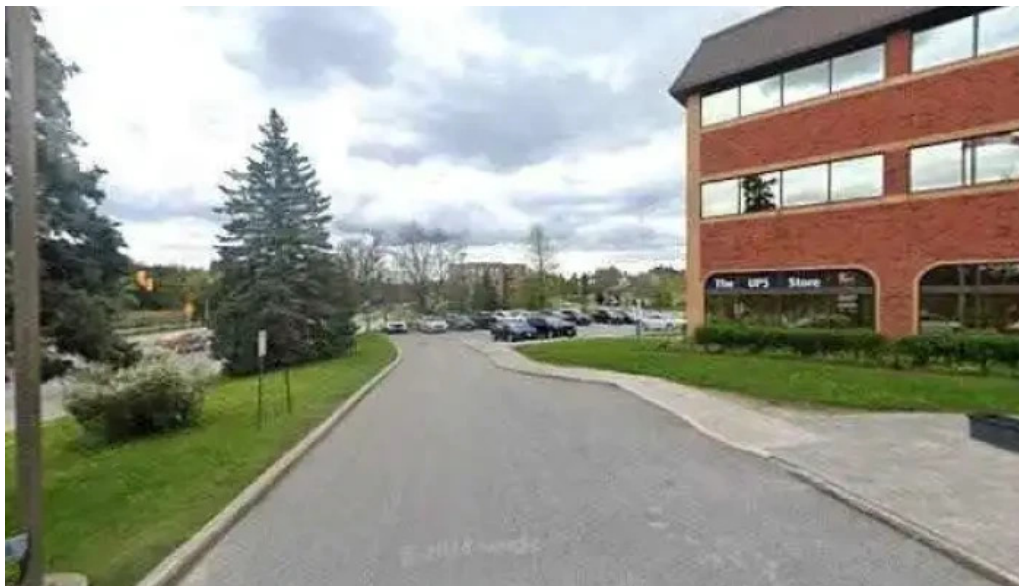
Your psychology centre all