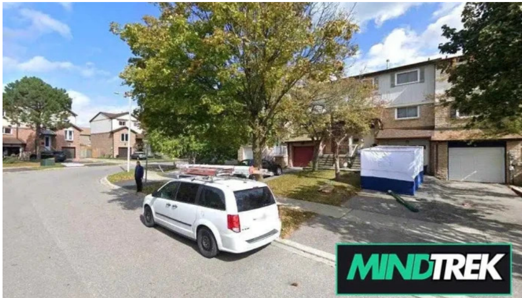
Dalton associates vaughan