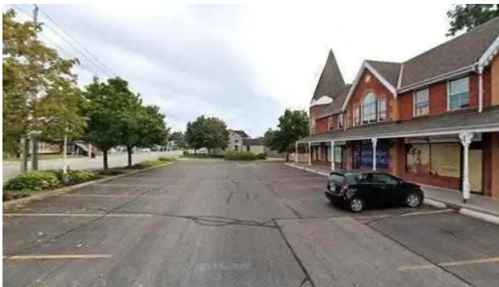
Dalton associates all