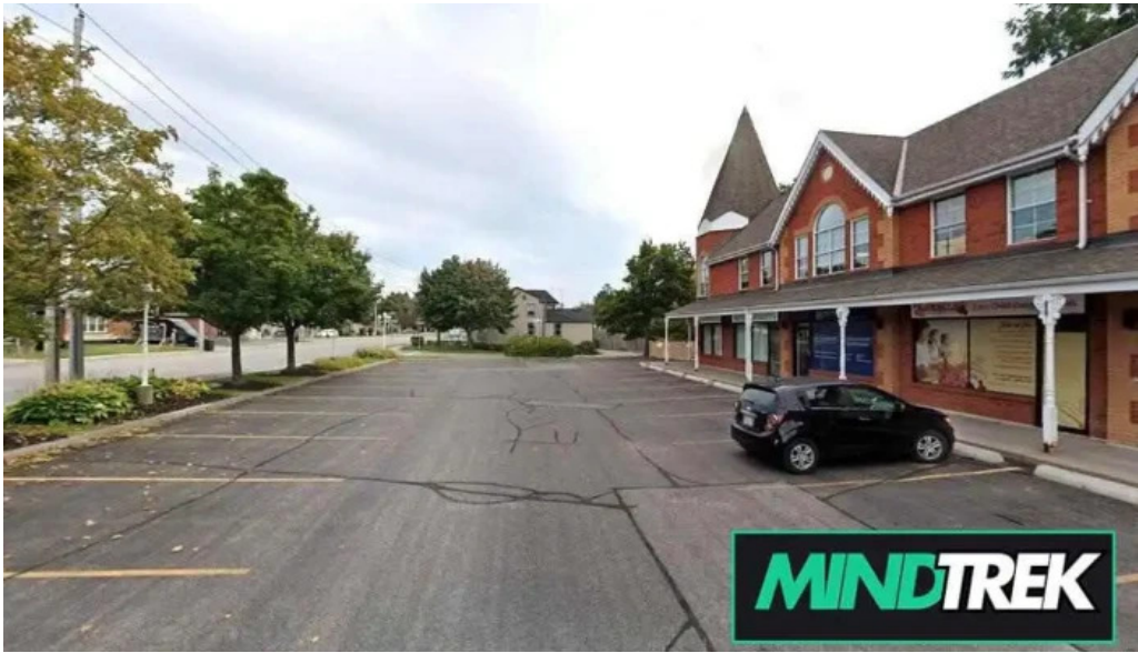
Dalton associates whitby

please deliver a message so we can we will fix it at the earliest convenience. Thank you in advance thank you very much.