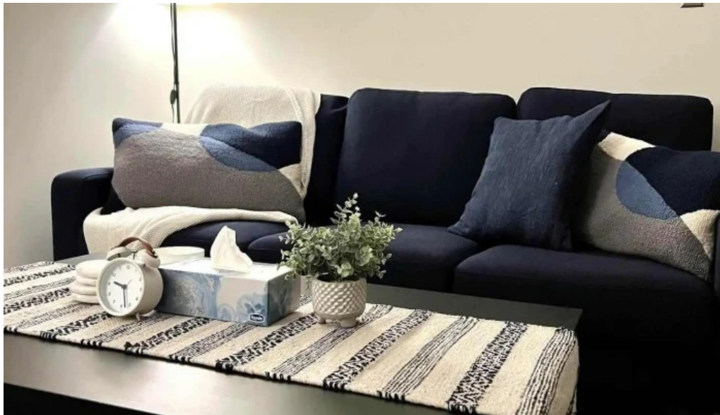
Feelings first counselling wellness by owner