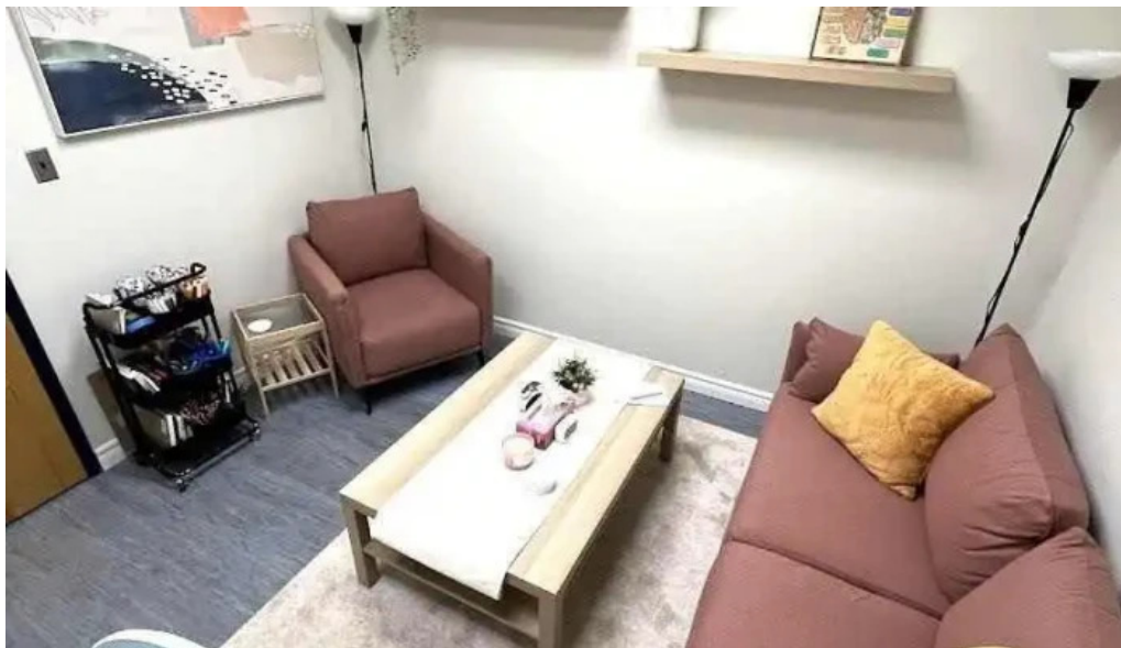
Feelings first counselling wellness alliston