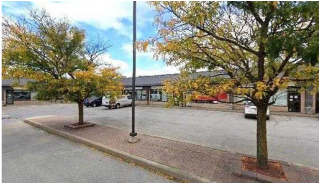
Feelings first counselling wellness street view 360deg