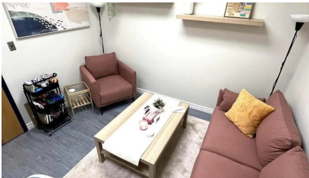
Feelings first counselling wellness all