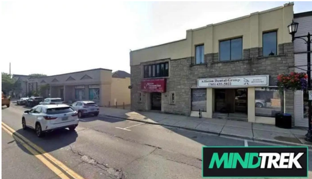
Lindsay crowe rsw alliston