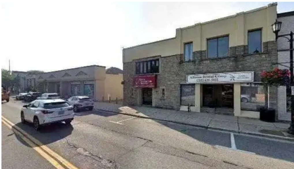
Lindsay crowe rsw all