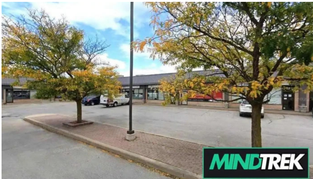
Oak and sands counselling services alliston