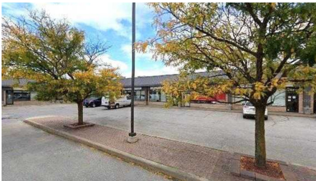
Oak and sands counselling services all