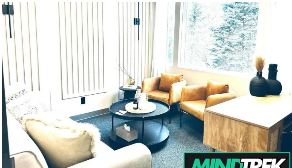
Petros therapy by owner