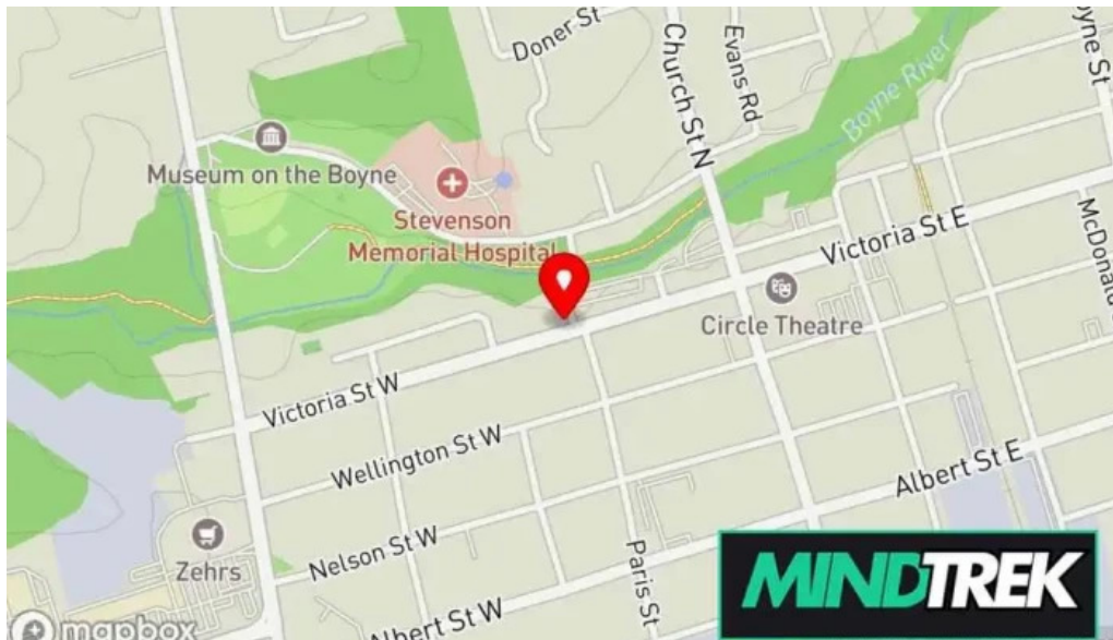
Petros therapy map