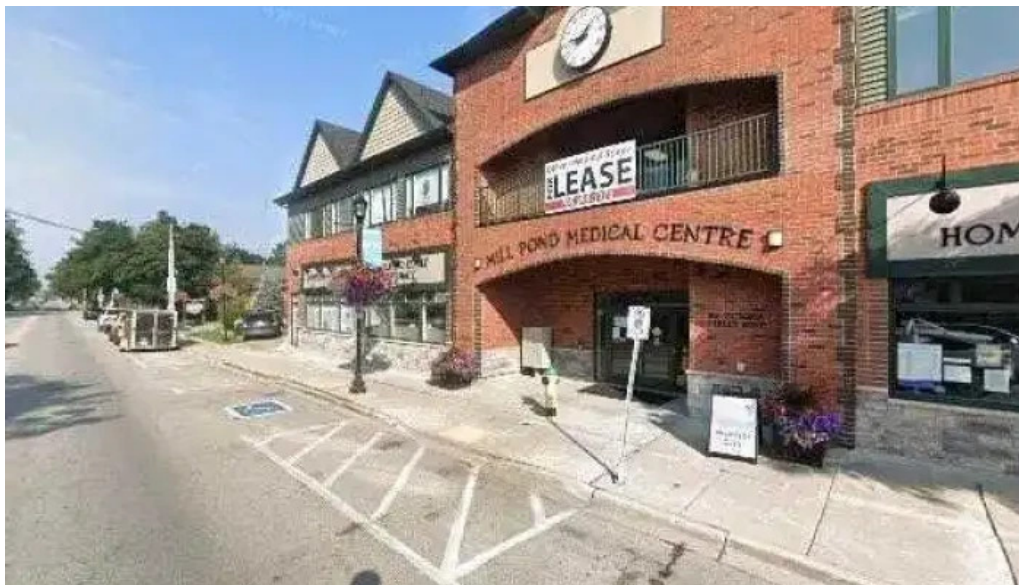
Petros therapy street view 360deg