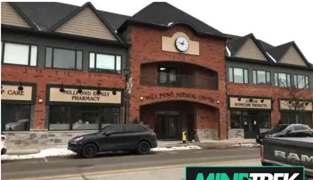
Sunlight psychotherapy alliston