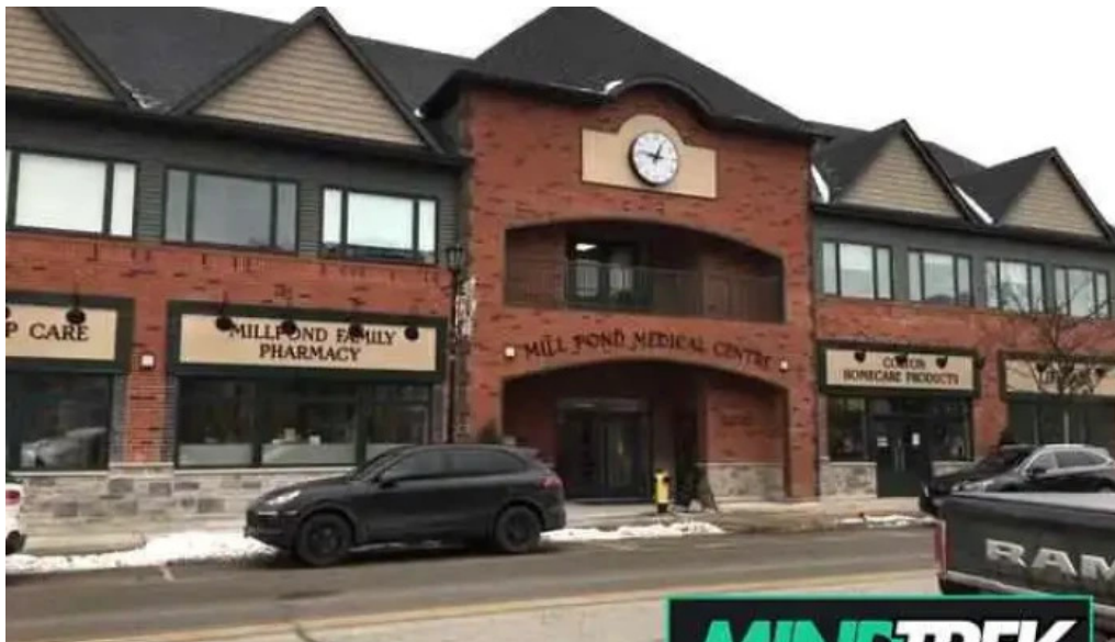
Sunlight psychotherapy all