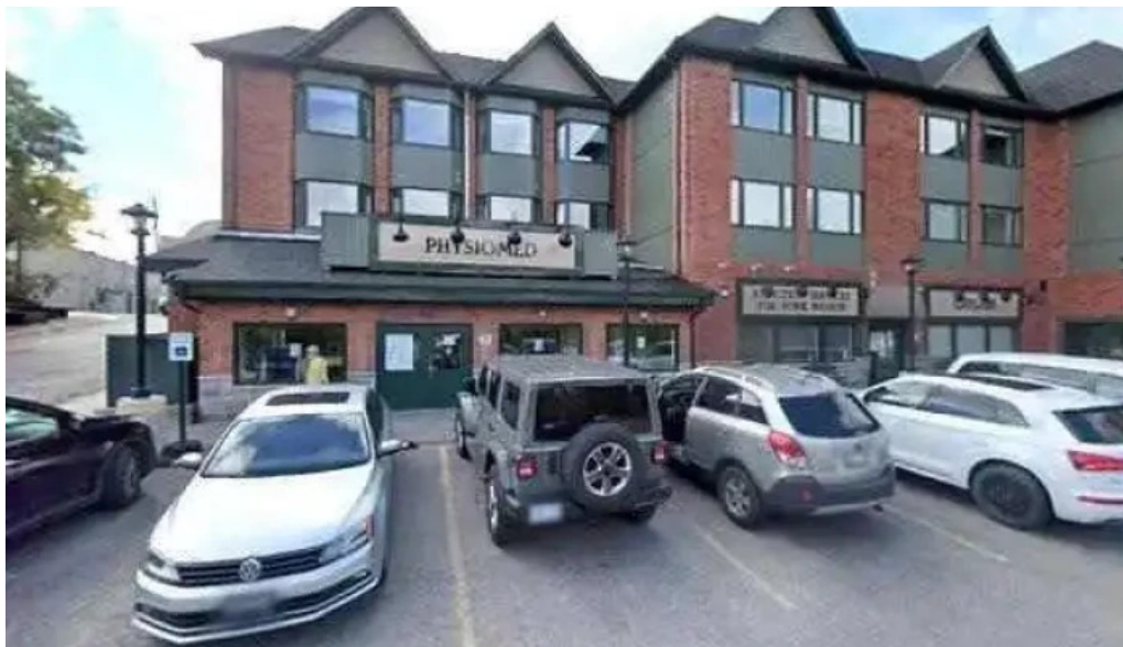
Sunlight psychotherapy street view 360deg