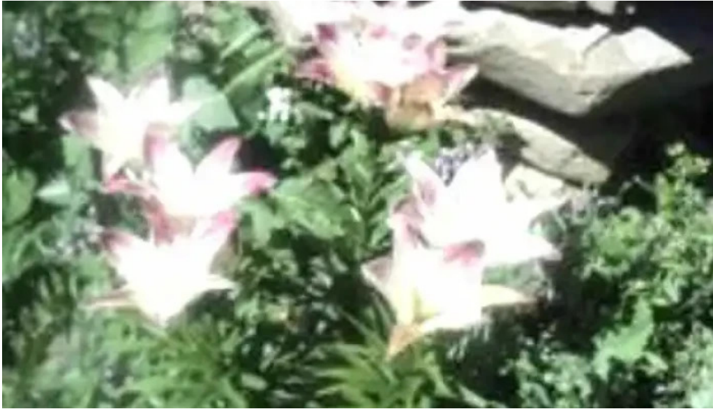
Sunlight psychotherapy by owner