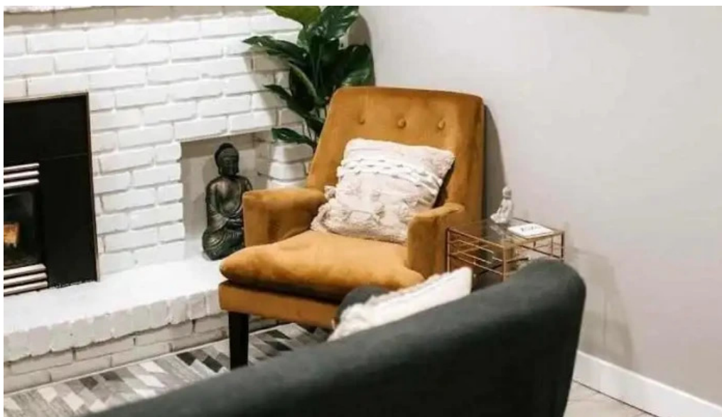
Roots in wellness ancaster