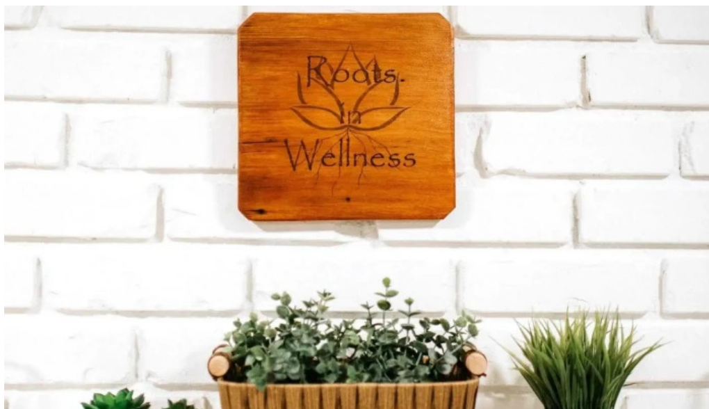
Roots in wellness by owner