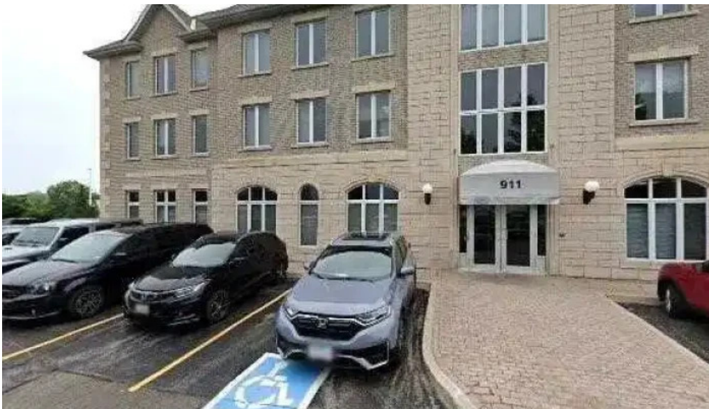
Roots in wellness street view 360deg