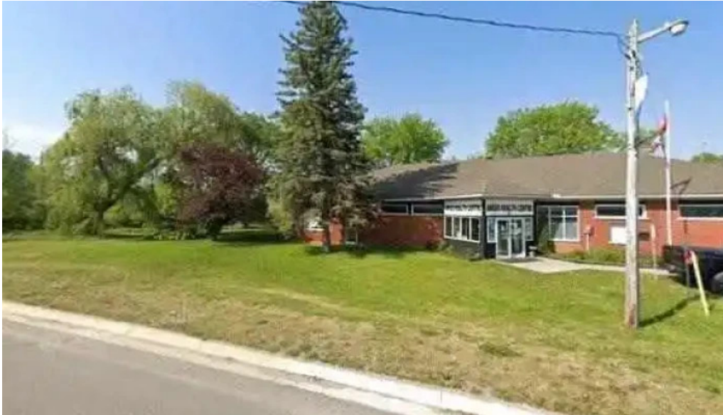
New leaf psychotherapy street view 360deg