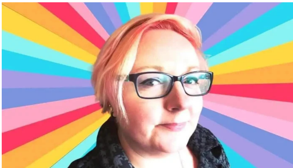
Prismatic compassion by owner