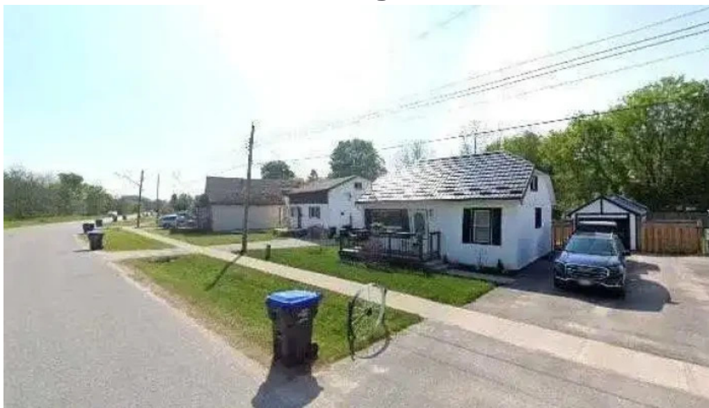
Prismatic compassion street view 360deg