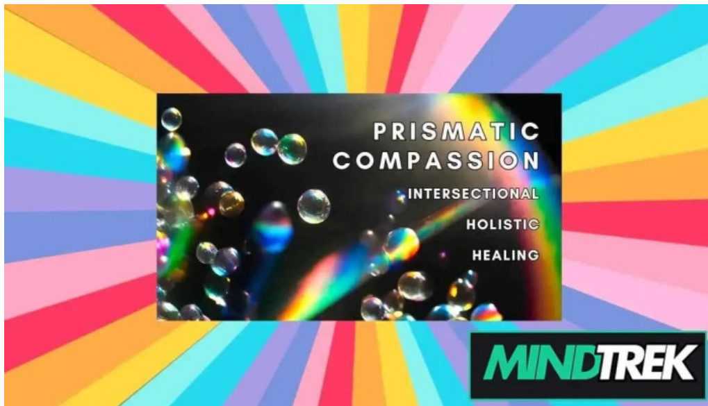
Prismatic compassion angus