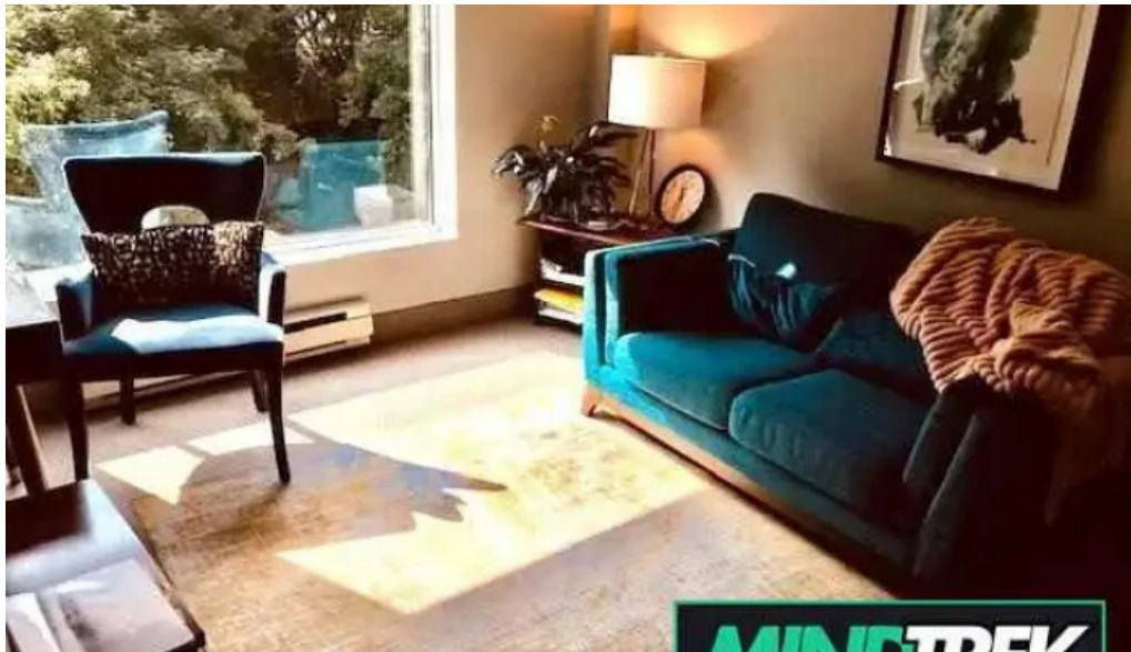
Aurora therapy neurofeedback by owner