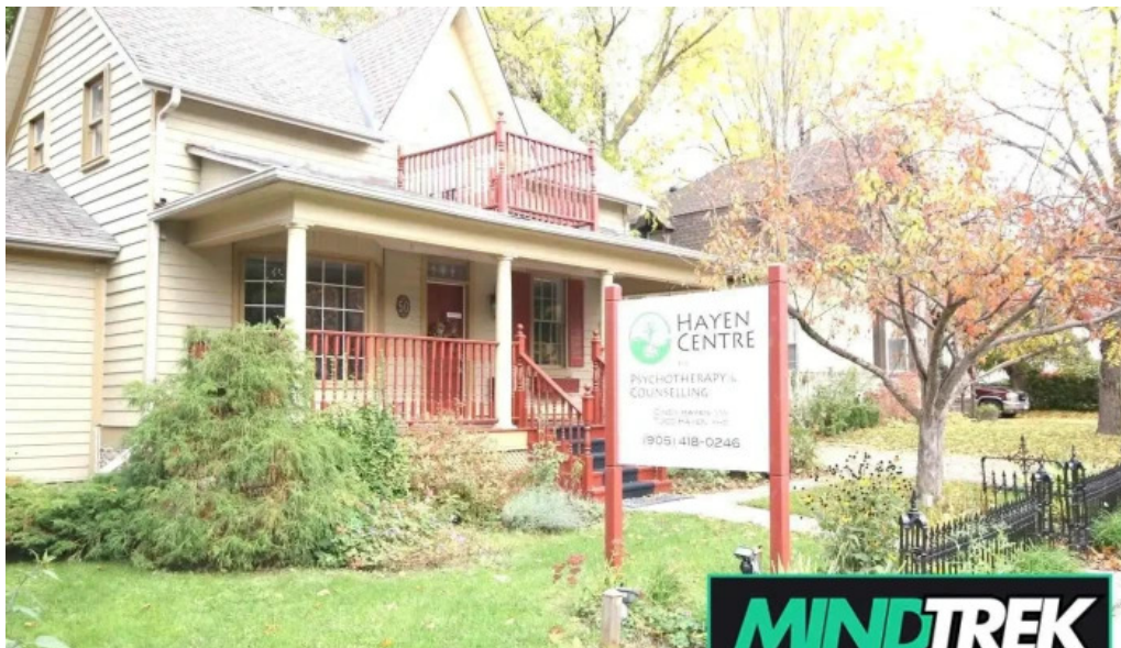
Hayen centre for psychotherapy aurora