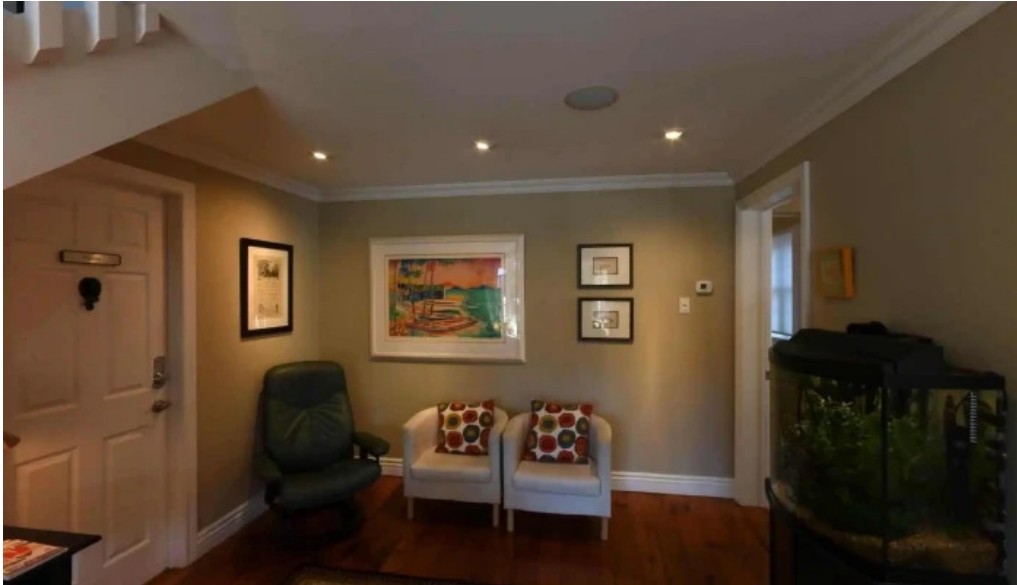
Hayen centre for psychotherapy street view 360deg