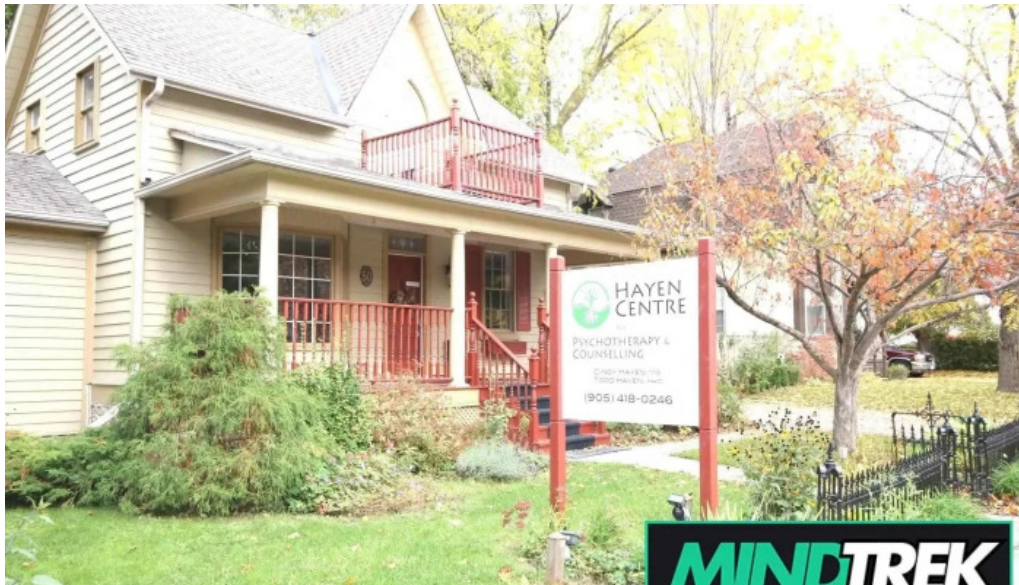
Hayen centre for psychotherapy all