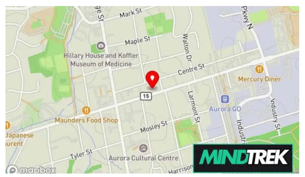
Todd hayen phd rp map