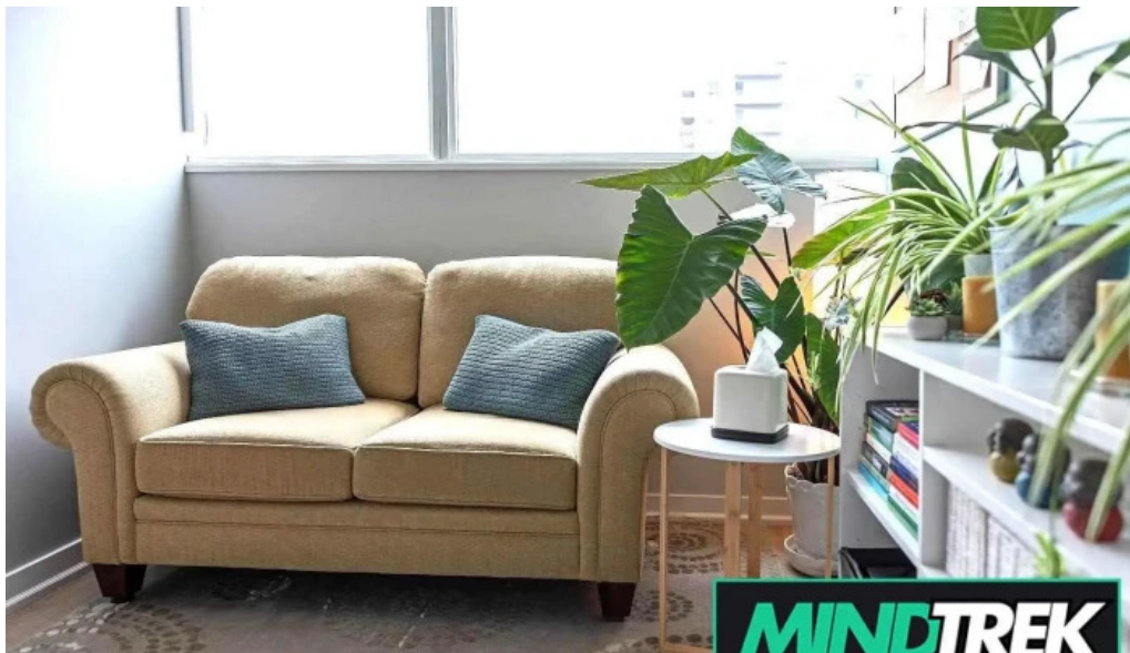
Baldwin psychotherapy barrie