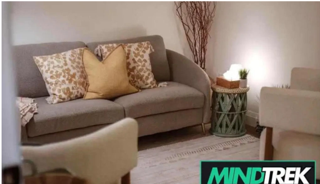
Baldwin psychotherapy by owner