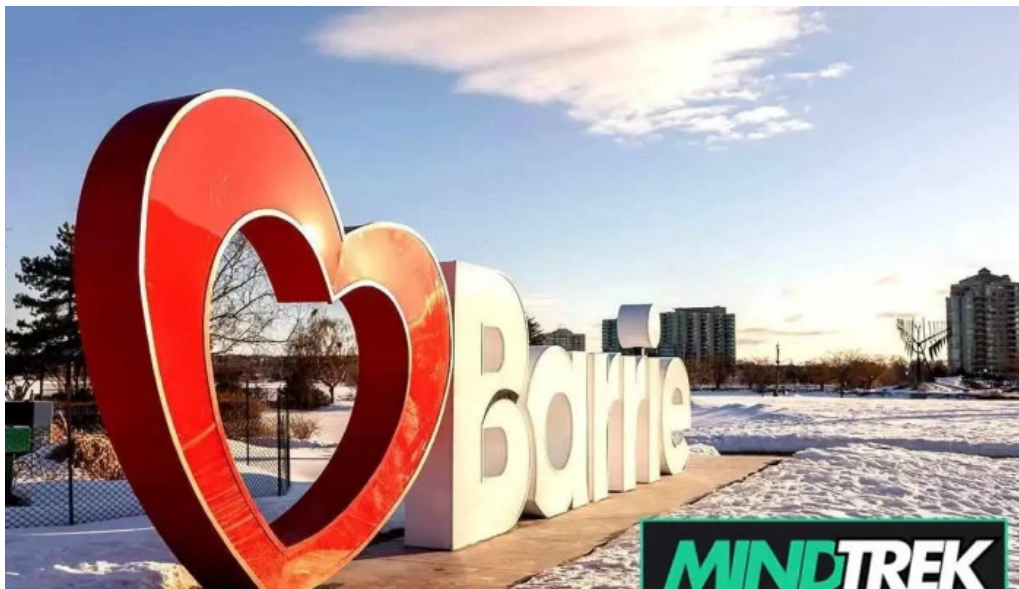
Healing voices psychotherapy all