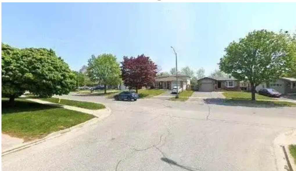
Healing voices psychotherapy street view 360deg