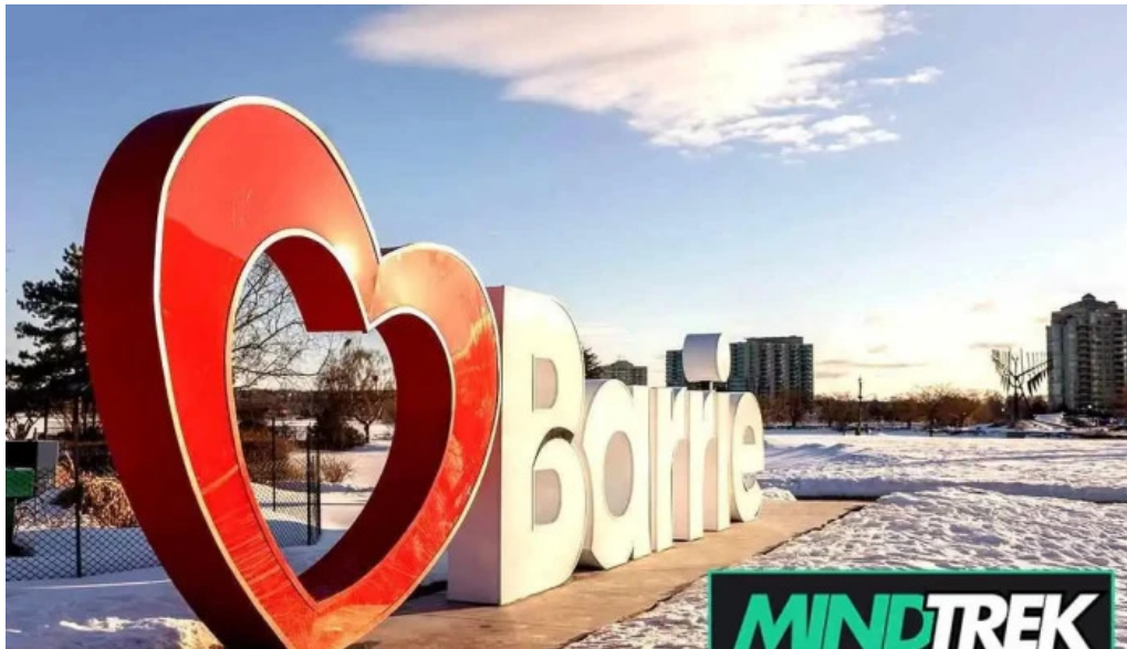
Healing voices psychotherapy barrie