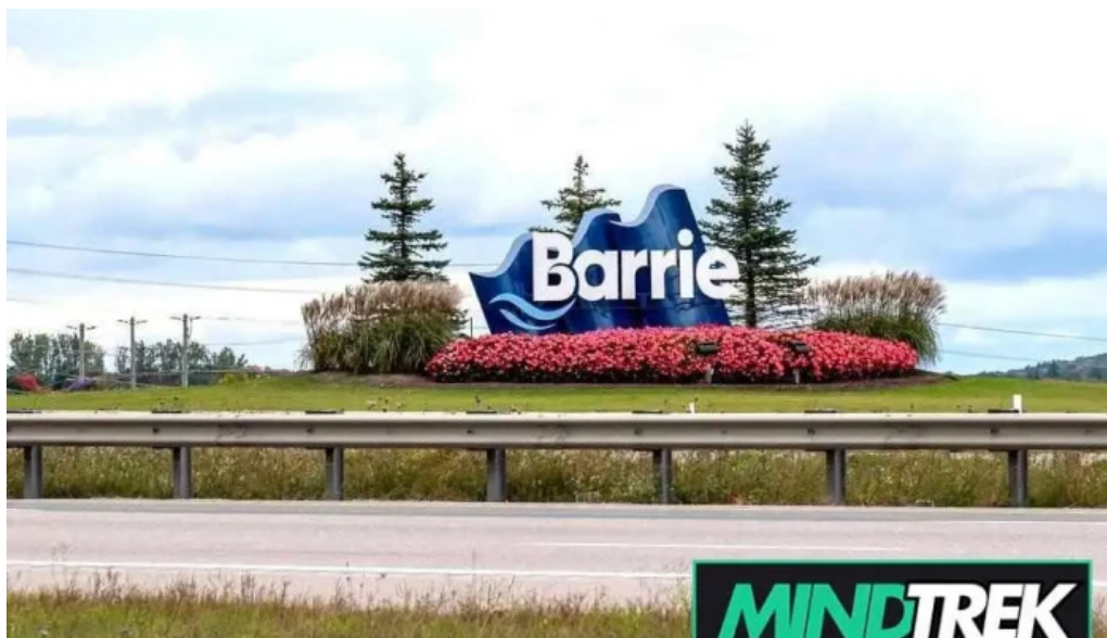
Healing voices psychotherapy by owner