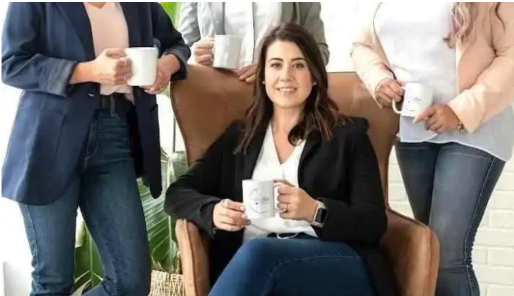
Mind shift therapy and neurofeedback maternal mental health and first responders trauma emdr barrie