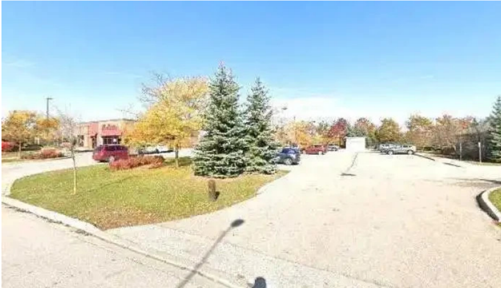
Mind shift therapy and neurofeedback maternal mental health and first responders trauma emdr street view 360de