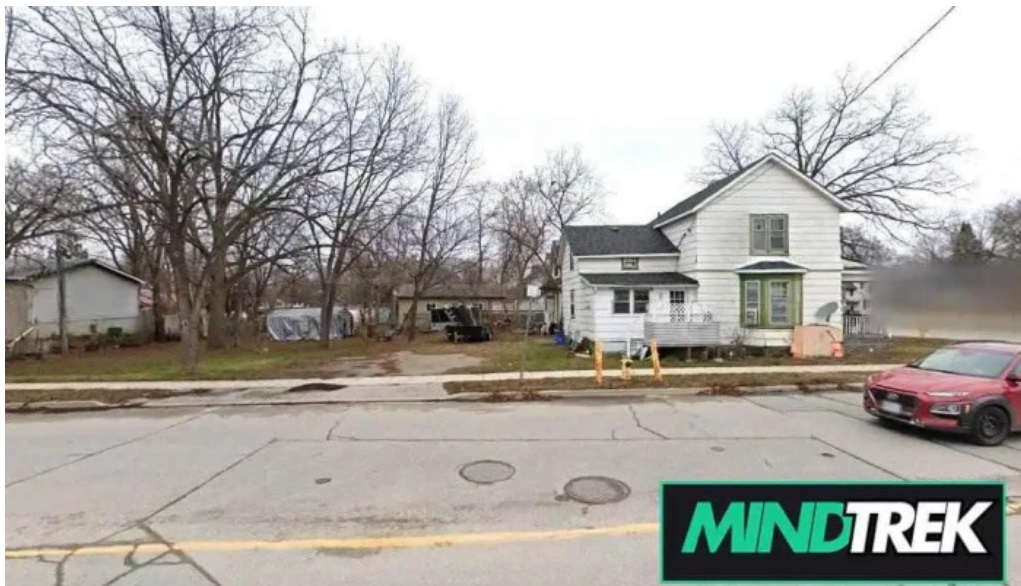
Ramsey counselling and psychotherapy services barrie