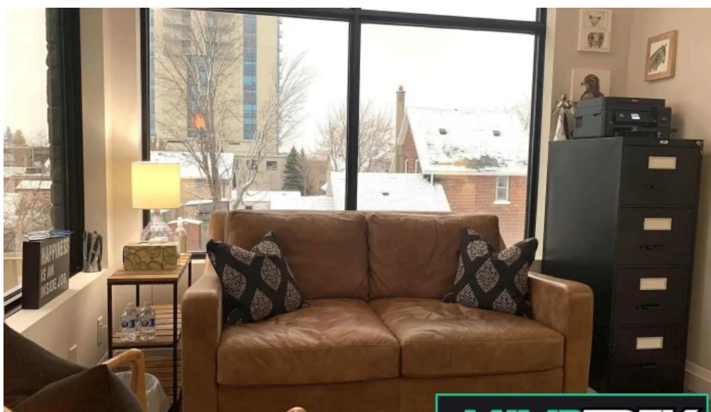
Tania e kingston rp rpc all