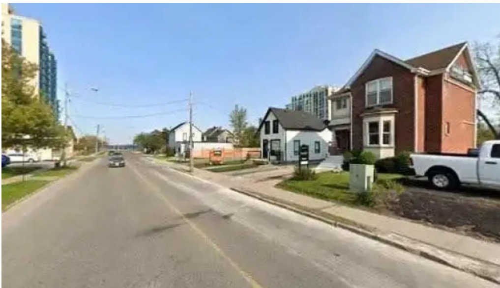
Tania e kingston rp rpc street view 360deg