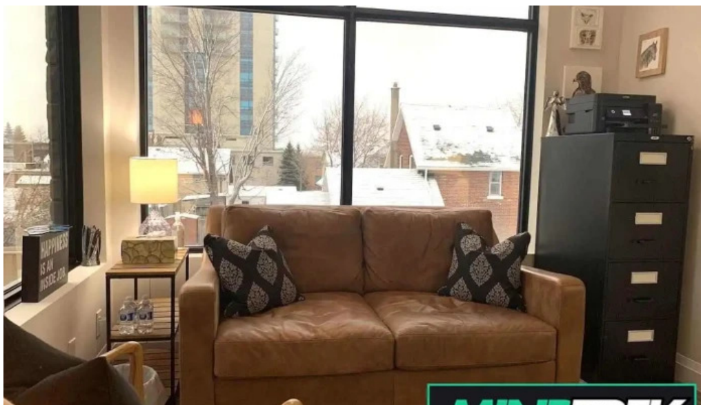
Tania e kingston rp rpc barrie