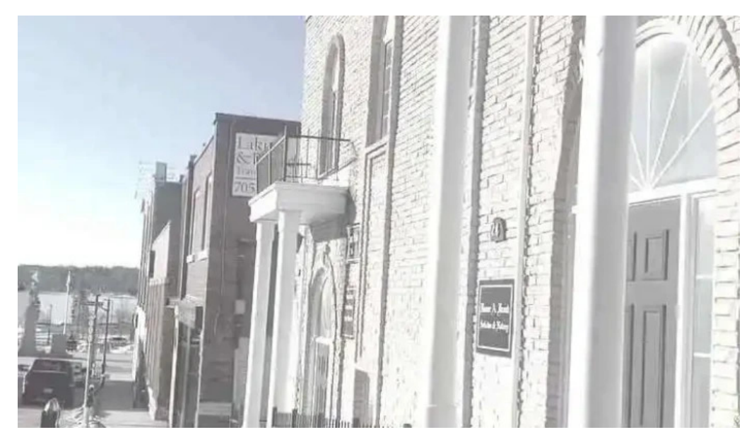
Vox mental health by owner