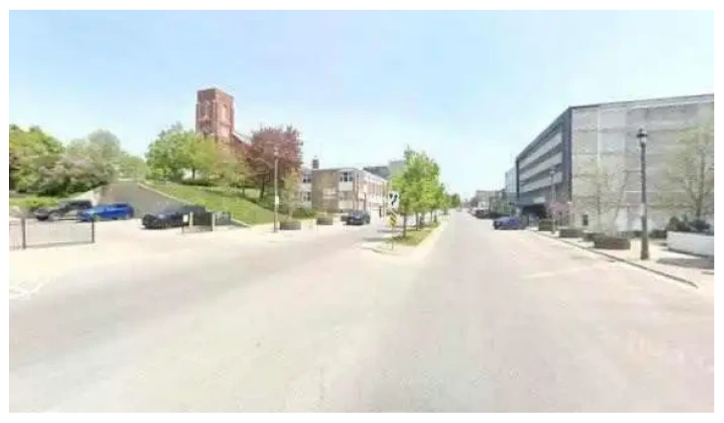
Vox mental health street view 360deg