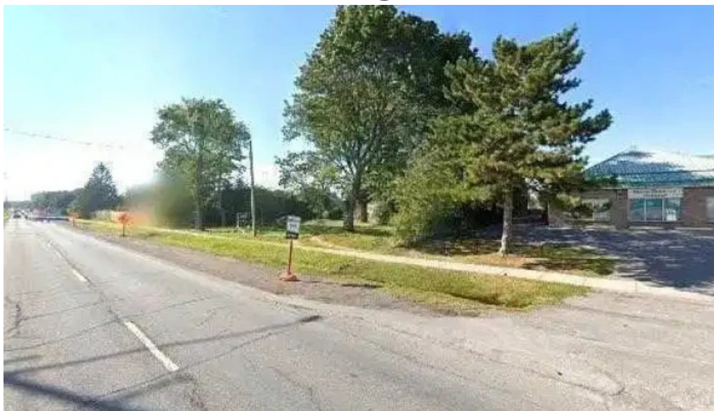
Hope harbour psychotherapy street view 360deg