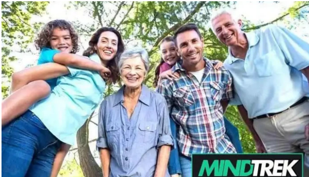
Hope harbour psychotherapy belleville