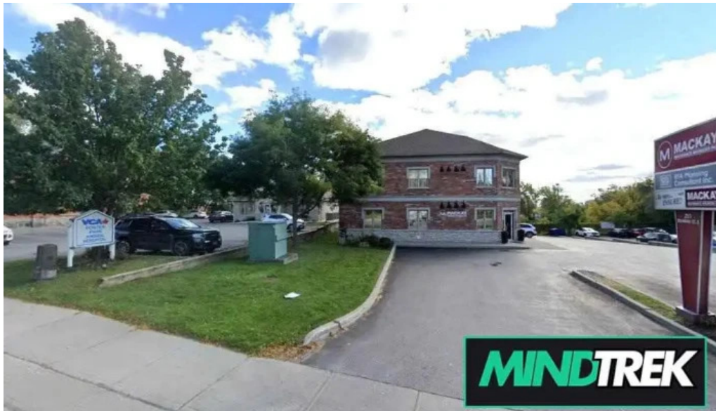
Ineke guadagnin counselling therapy belleville