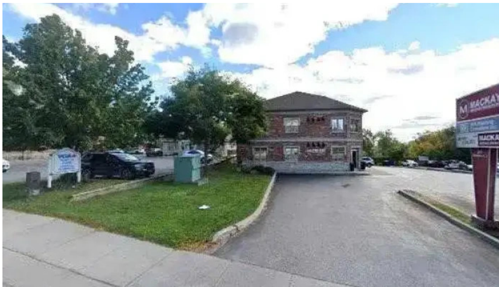
Ineke guadagnin counselling therapy all