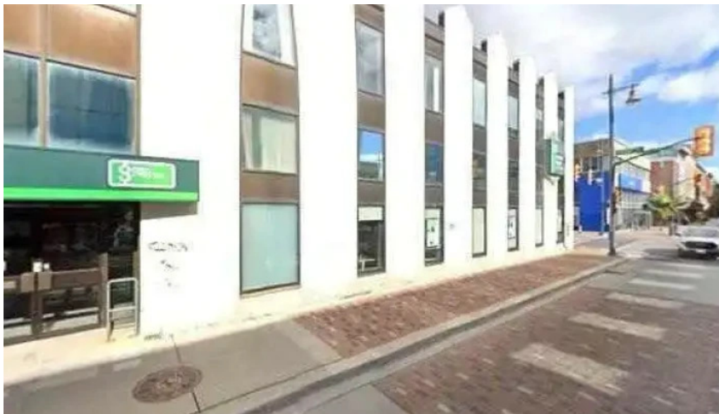
Mallory suurd psychotherapy all