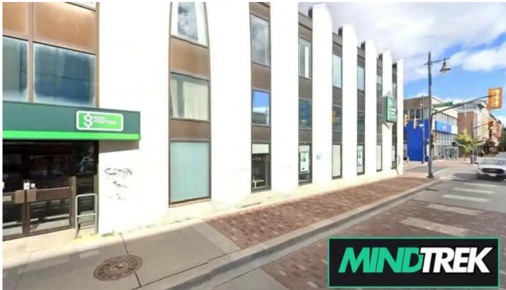
Mallory suurd psychotherapy belleville