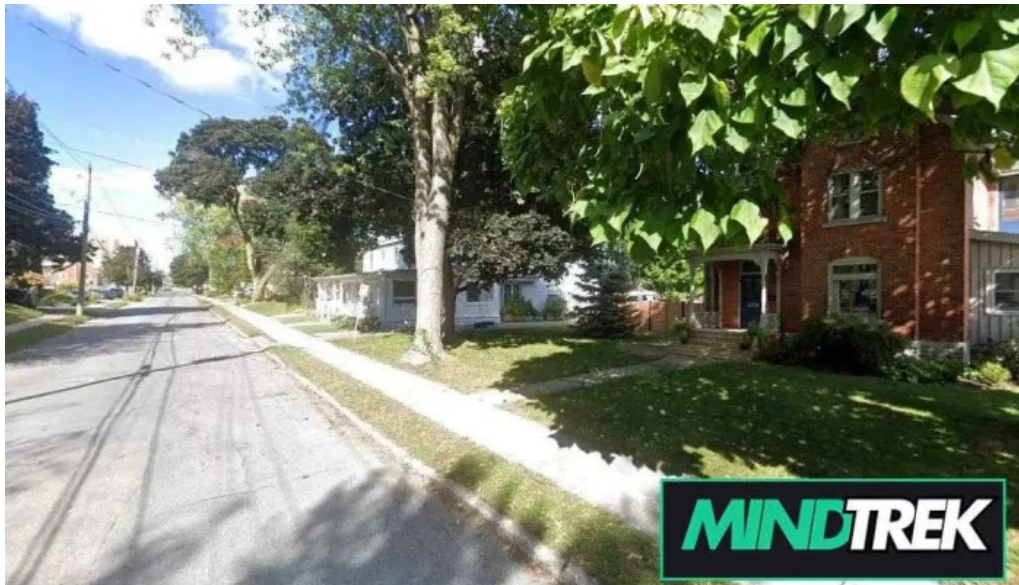
Qxplore inc belleville