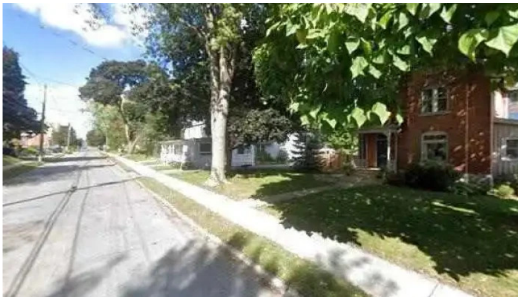
Qxplore inc all