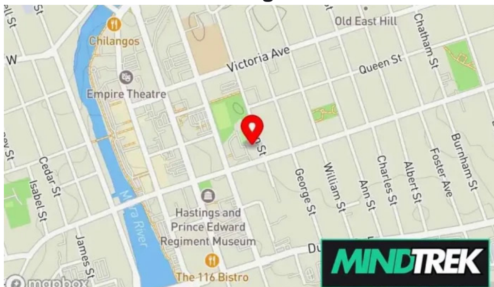
Qxplore inc map