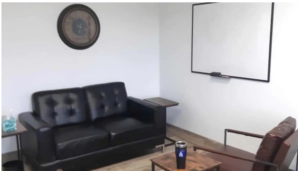
Robichaud therapeutic services group all