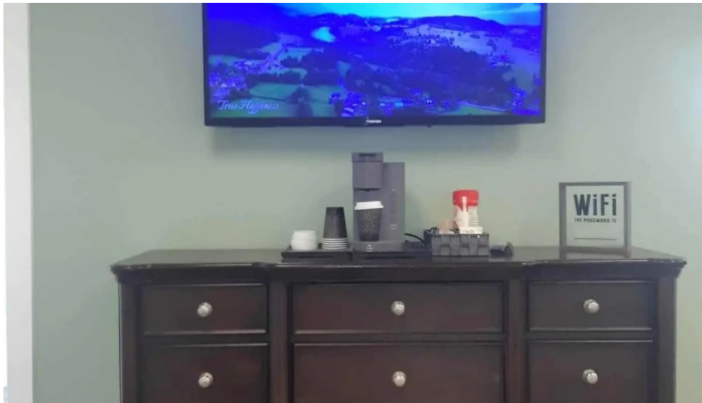
Robichaud therapeutic services group by owner