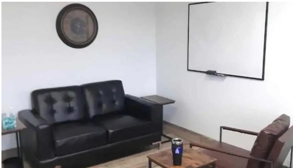
Robichaud therapeutic services group belleville