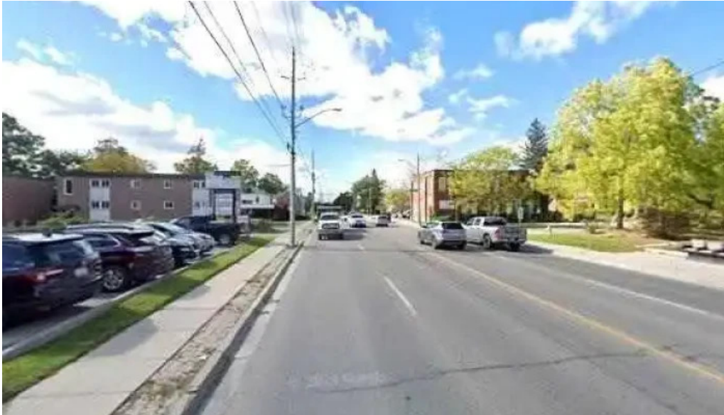
The centre for family preservation and wellness street view 360deg