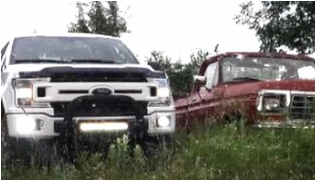
The centre for family preservation and wellness psychotherapist