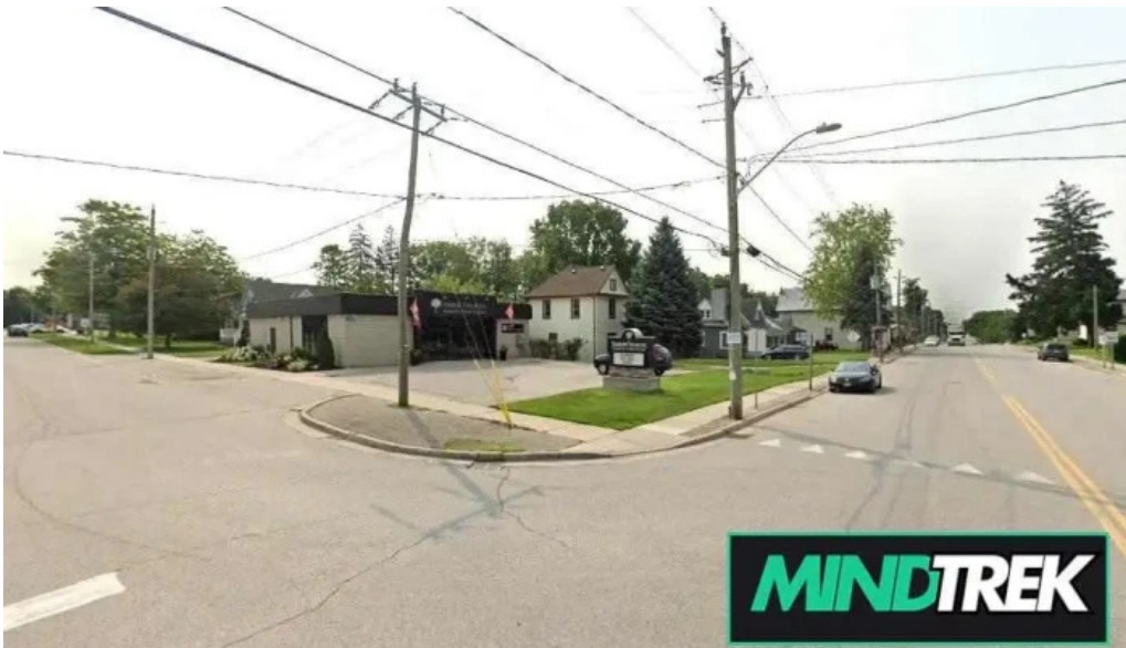
Willsie counselling belmont