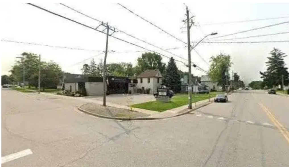
Willsie counselling all