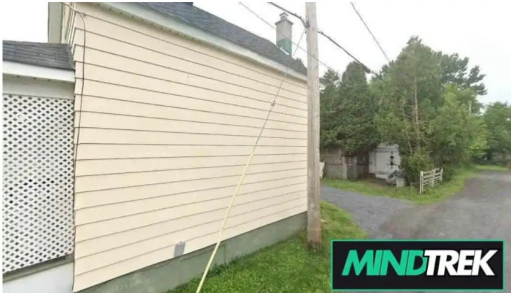
Leaf psychotherapy services cornwall