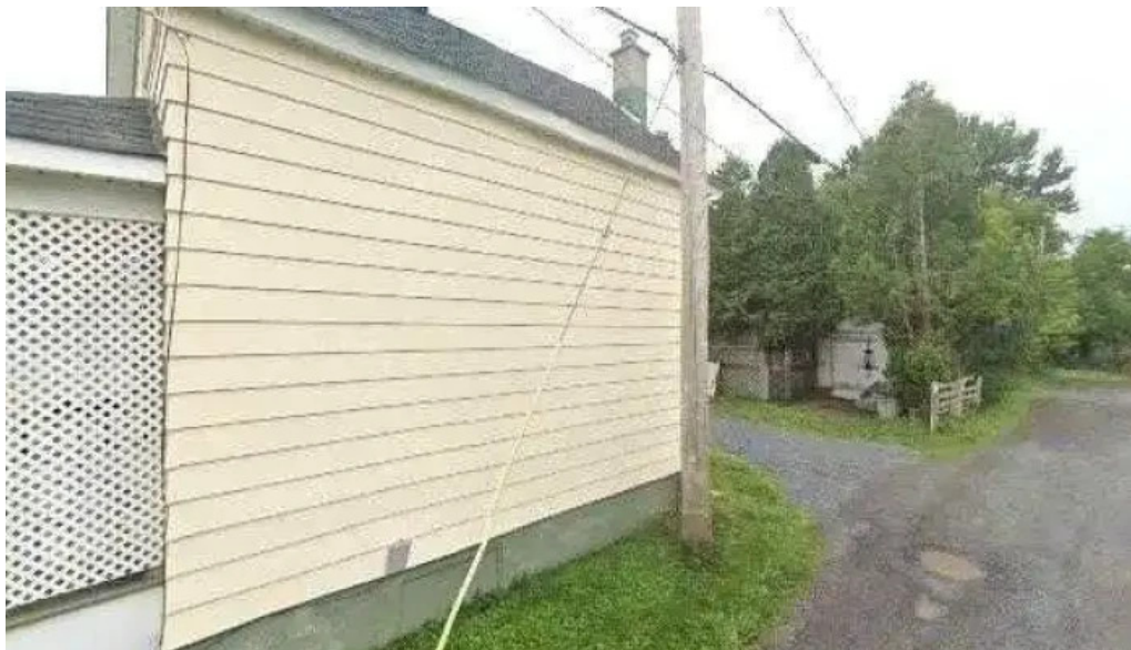
Leaf psychotherapy services all