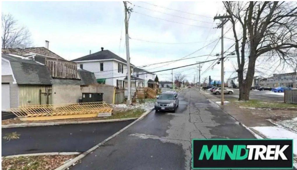
Renewed living counselling cornwall