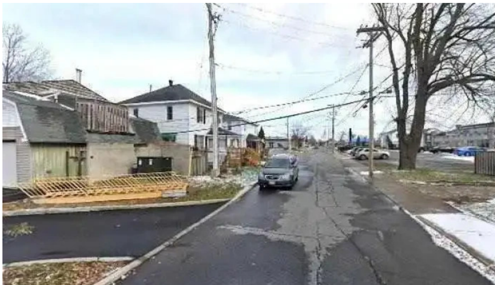
Renewed living counselling all