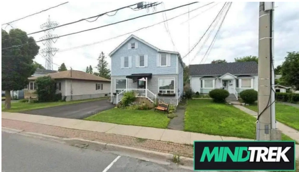
Valley counselling psychotherapy cornwall