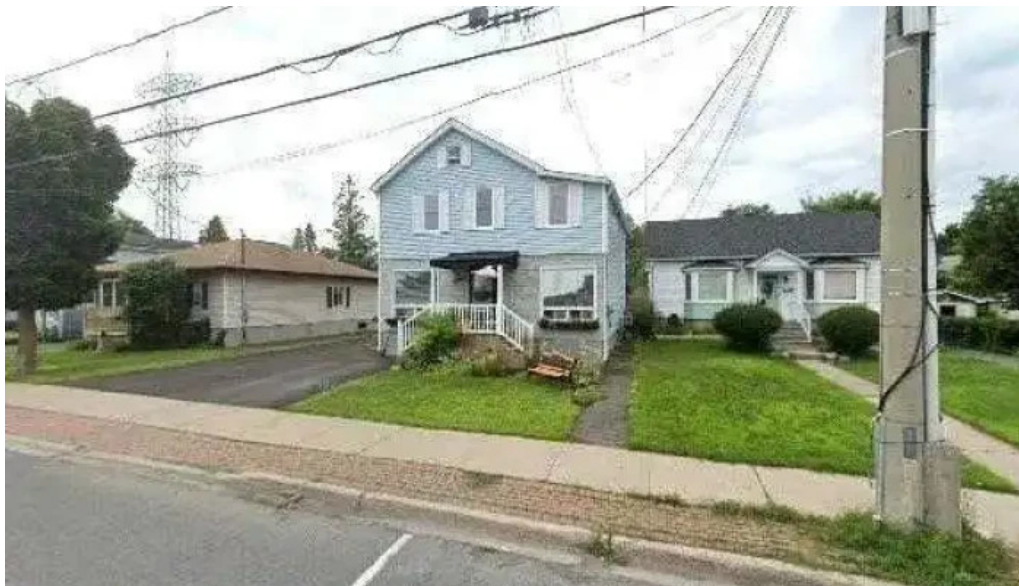
Valley counselling psychotherapy all