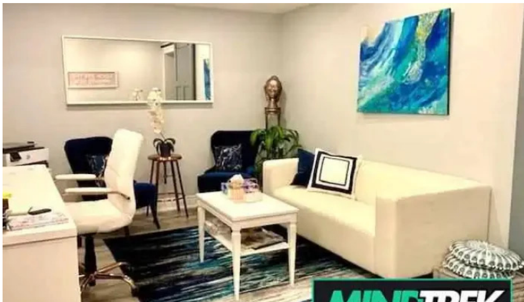
Checking in counselling consulting crystal beach