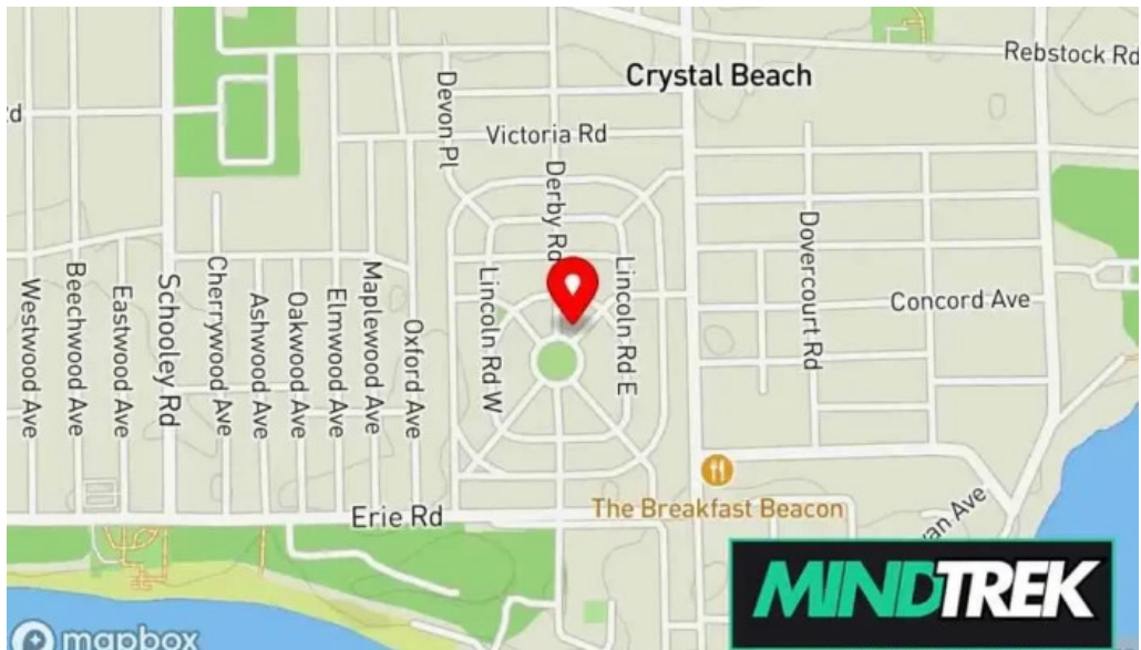
Checking in counselling consulting map