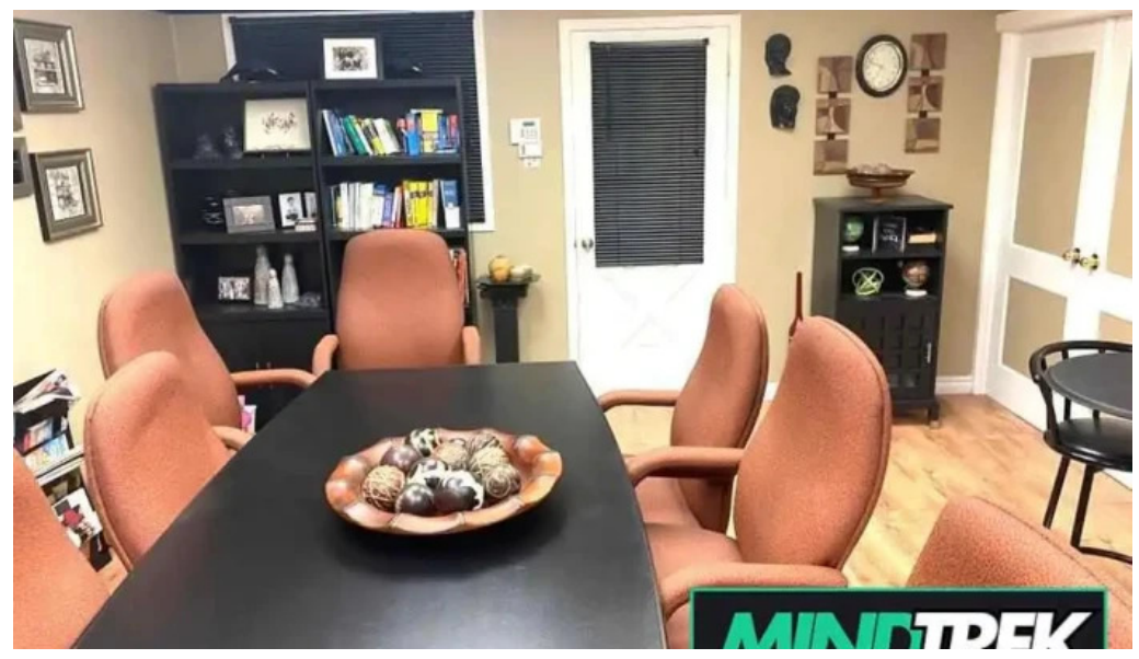
Counselcarecanada life solutions dresden