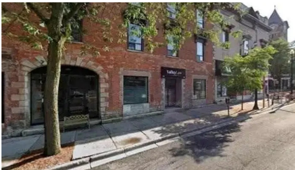
Wildflower psychotherapy all