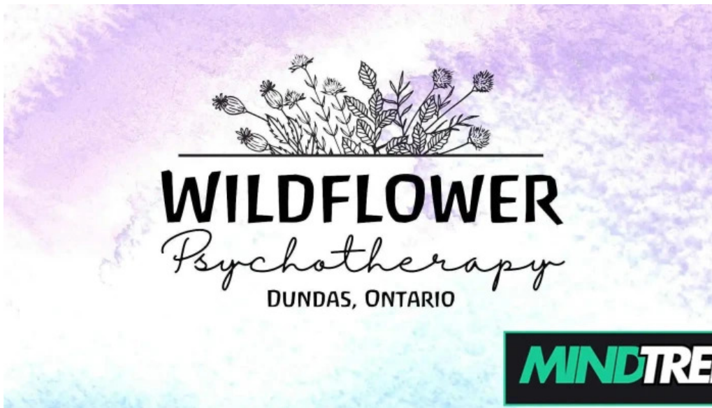
Wildflower psychotherapy by owner