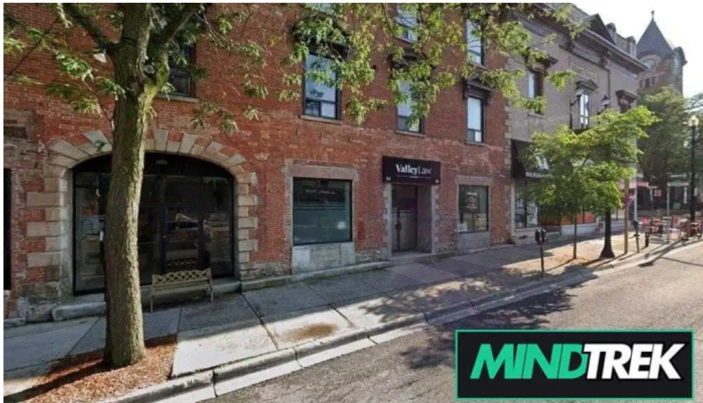
Wildflower psychotherapy dundas