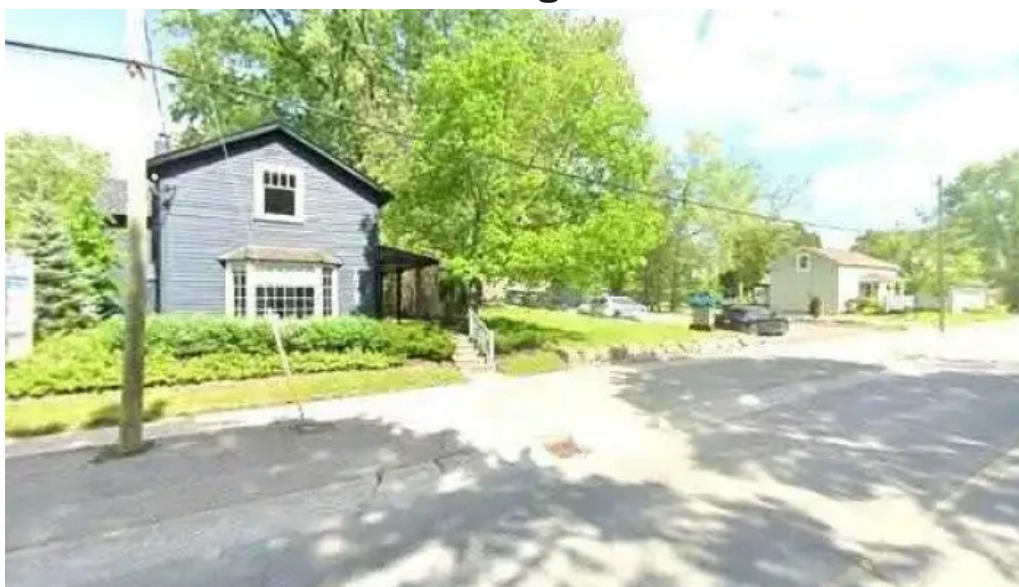
Turning stones therapy street view 360deg