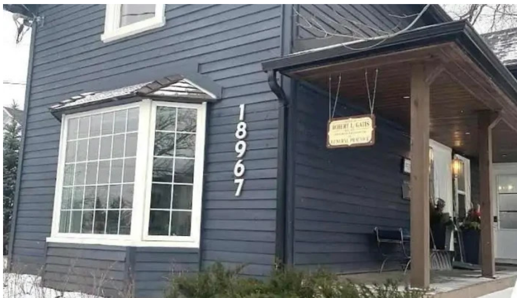
Turning stones therapy east gwillimbury