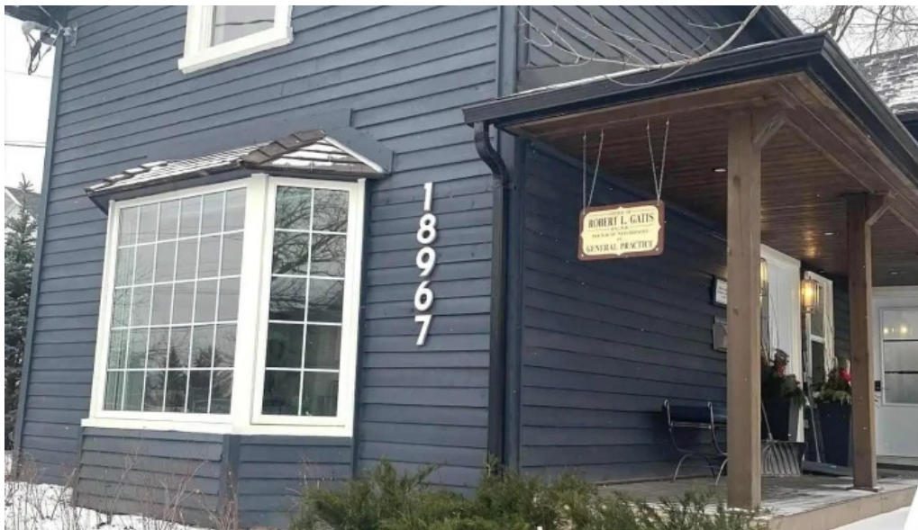
Turning stones therapy all