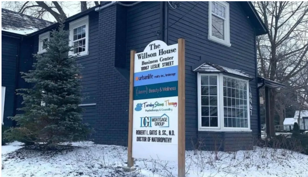
Turning stones therapy by owner