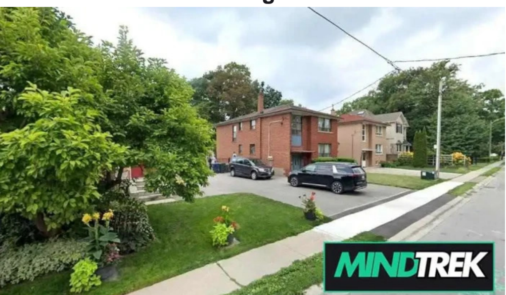
Isheaga counseling services etobicoke