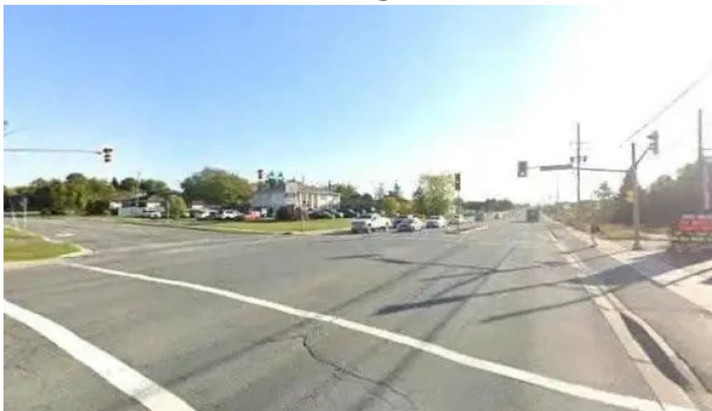
Betty ann mcpherson ma street view 360deg