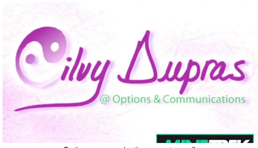
Options communications greater sudbury