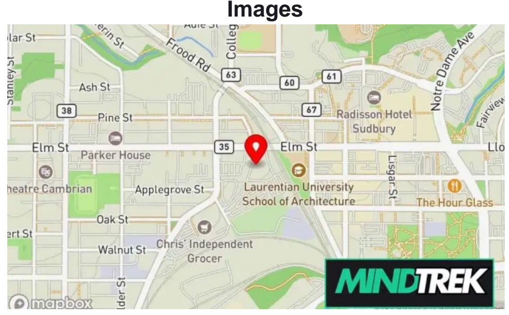
Options communications map

In case you want to modify any information that you think is not precise related to this site, please forward a message so that we will adjust it as soon as possible. In advance thank you very much.