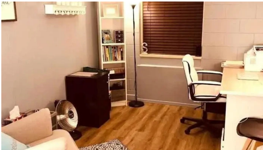
Realign psychotherapy greater sudbury