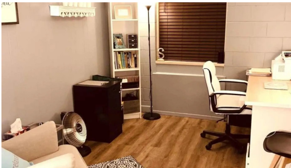
Realign psychotherapy all