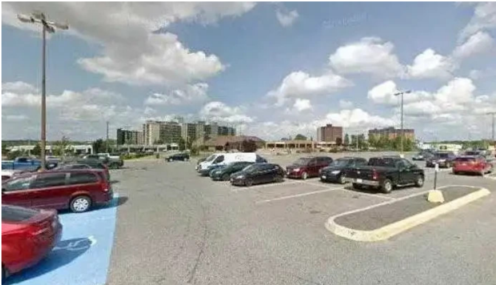
Realign psychotherapy street view 360deg