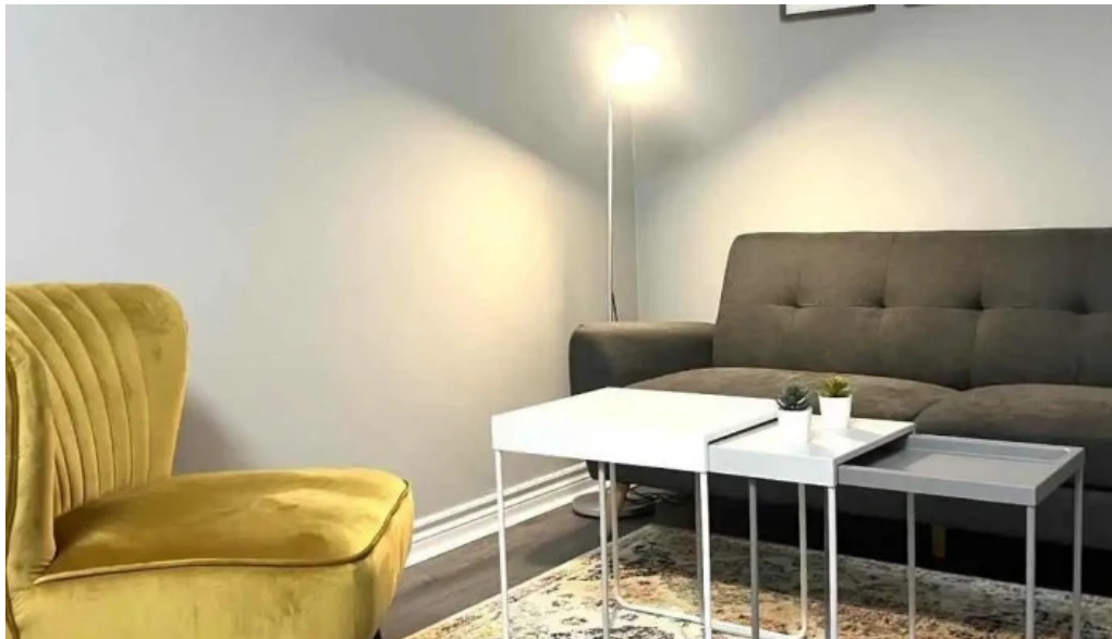
Roles associates psychotherapy services inc greater sudbury