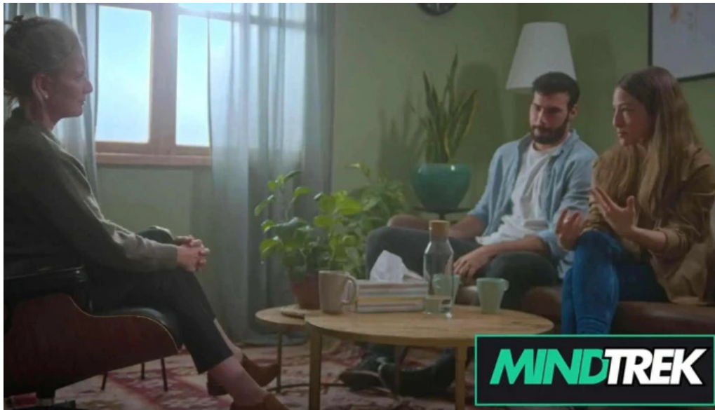
Roles associates psychotherapy services inc by owner