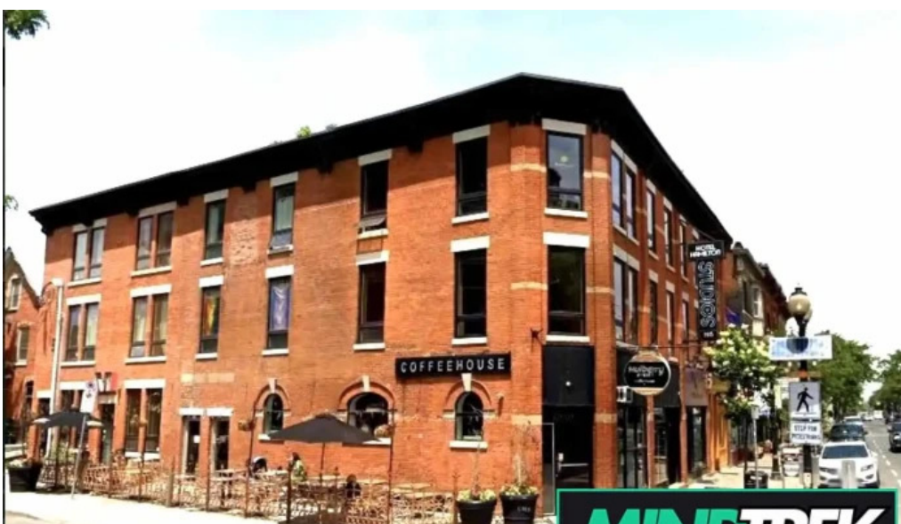
Cbt solutions all