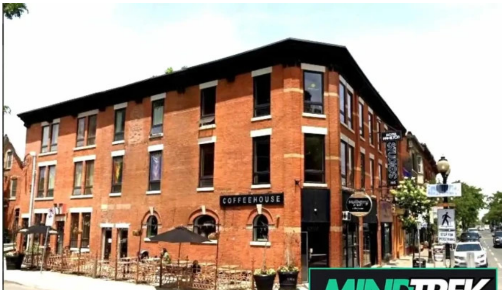
Cbt solutions hamilton