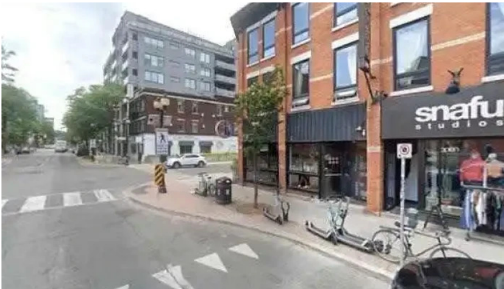
Cbt solutions street view 360deg