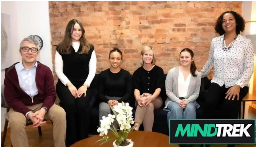
Cbt solutions latest