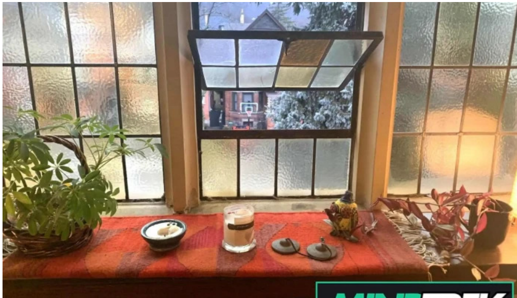
Counselling in hamilton building