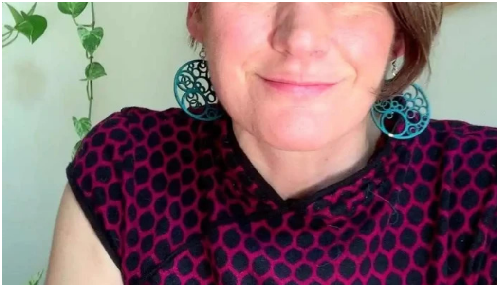
Counselling in hamilton videos