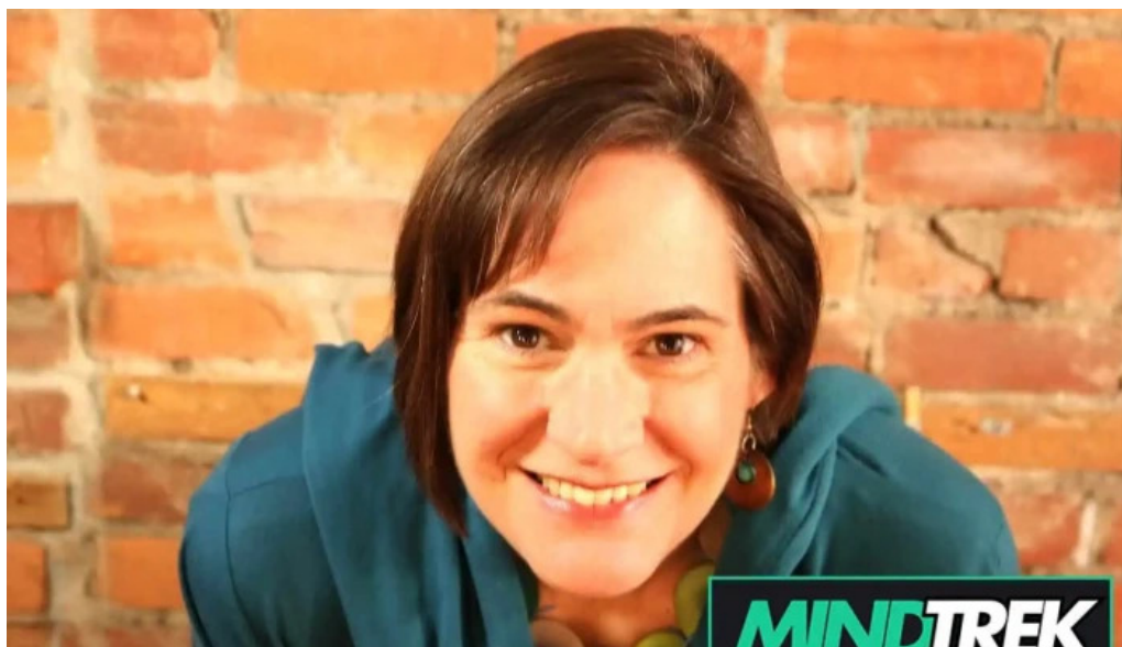
Counselling in hamilton hamilton