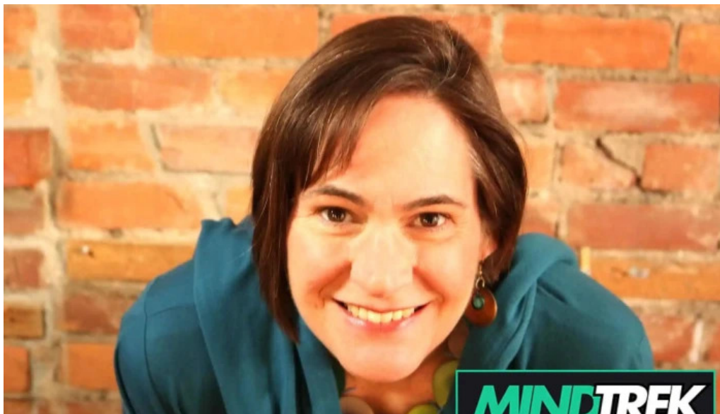
Counselling in hamilton all