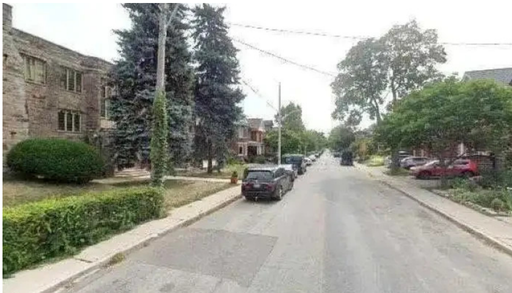
Counselling in hamilton street view 360deg