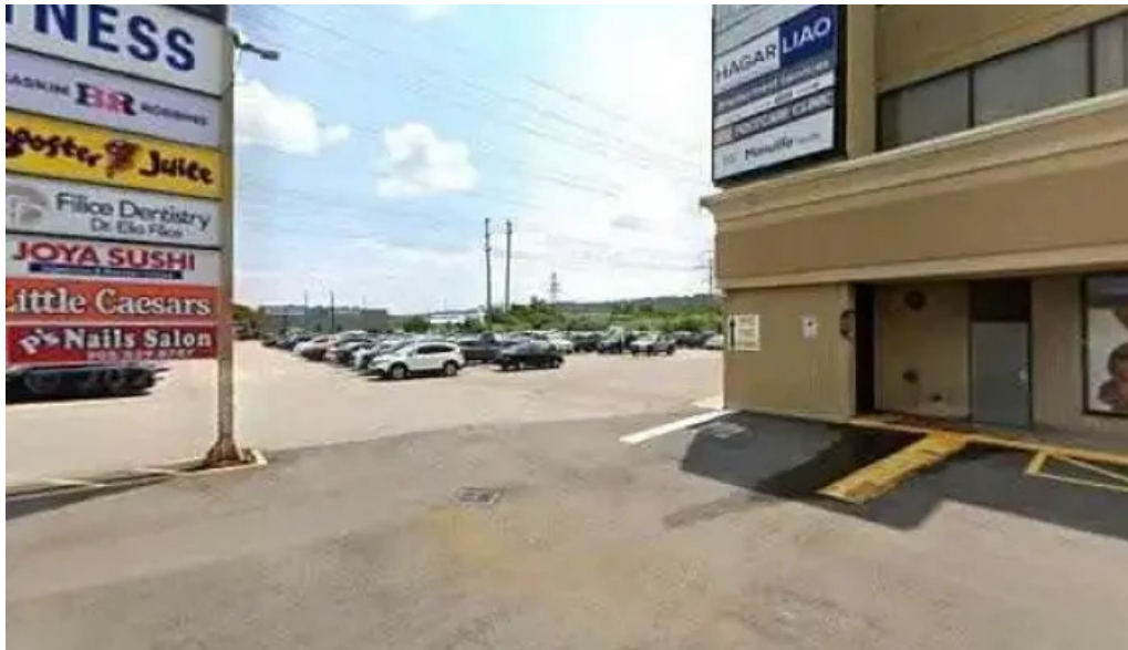
Evans family counselling psychotherapy street view 360deg