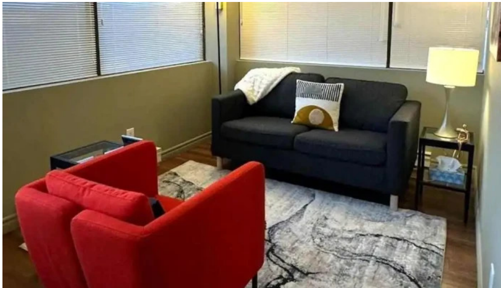
Evans family counselling psychotherapy hamilton