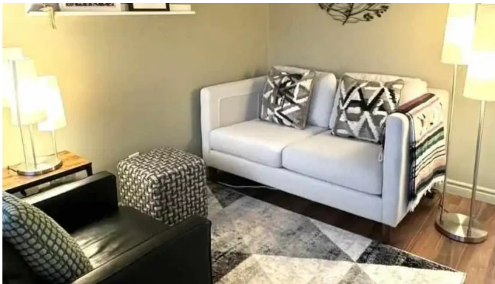
Evans family counselling psychotherapy by owner