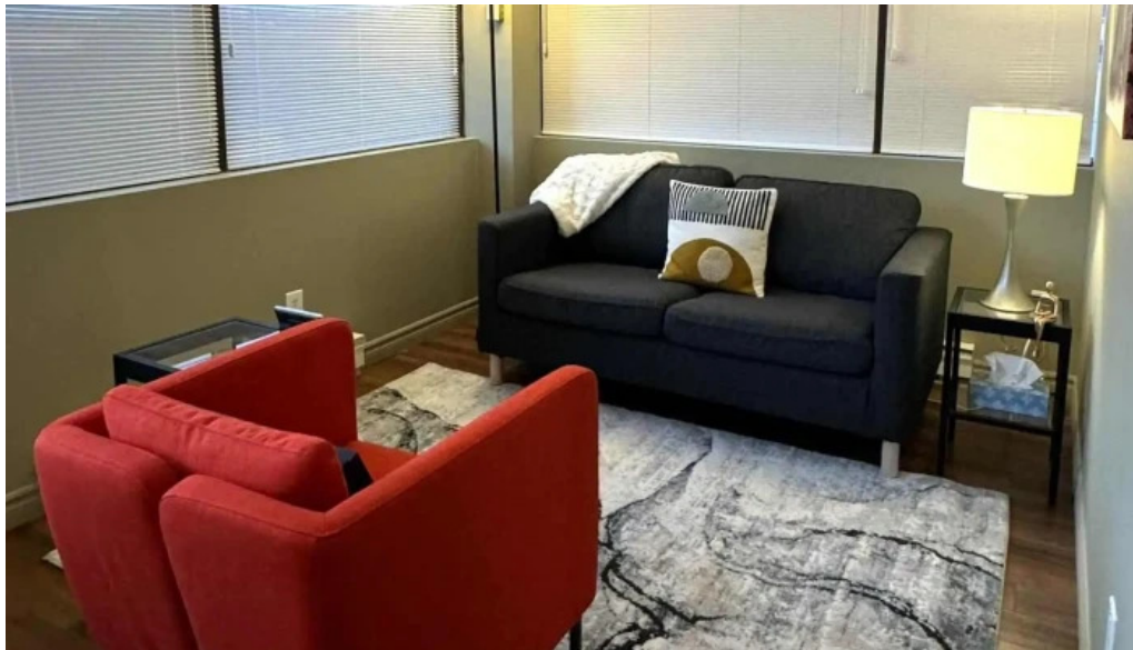
Evans family counselling psychotherapy all